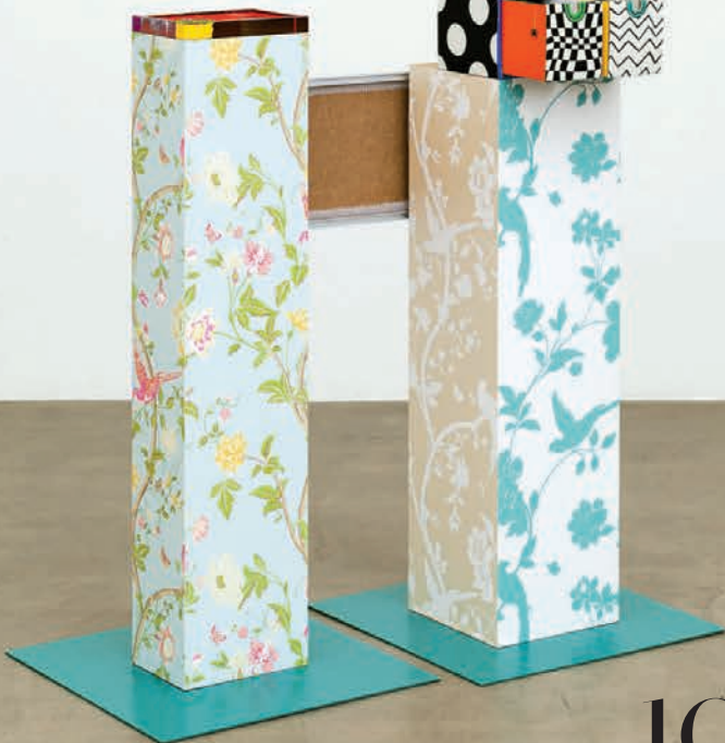
Verena Dengler's Laura 1 & Laura 2 , 2013