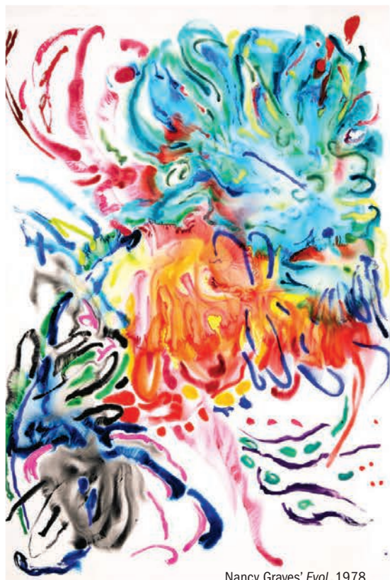
Nancy Graves' Evol , 1978