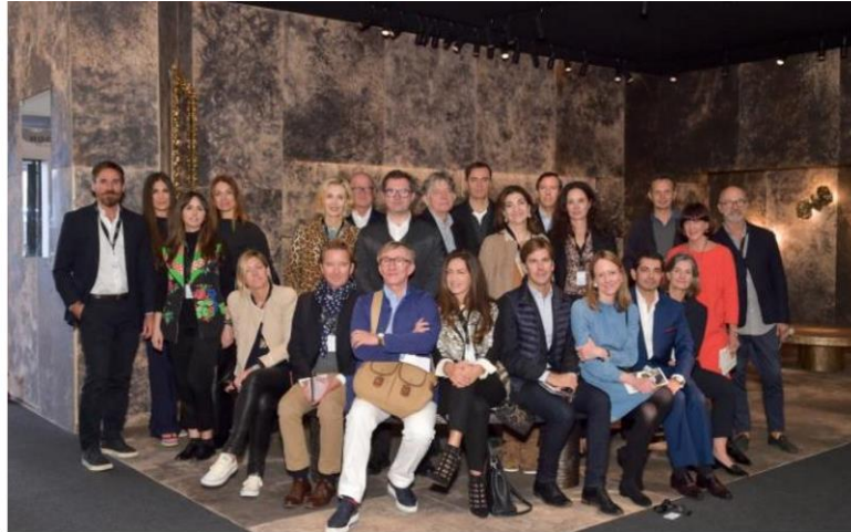
The judges of the PAD London art and design fair are presided over by Jasper Conran

An international crowd of art and design collectors flocked to Mayfair's Berkeley Square yesterday as Patrick Perrin's annual "cabinet of curiosities", aka the PAD fair, settled in for the week. Returning to London for the 10th time, PAD, which began with the Paris edition in 1997, has earned a reputation for being the fair for 20th-century and contemporary design collectables, even though it also covers jewellery , modern art, antiquities and tribal art, glass and ceramics and photography.