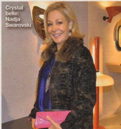
Crystal belle: Nadja Swarovski

The great and the good gathered at London's Berkeley Square to attend a VIP collectors' preview of PAD London, the annual fair that brings together 20th-century art, photography, design and decorative arts. More than 3,000 guests, including many of the world's most influential dealers, pressed into the pop-up pavilion in Mayfair and brushed shoulders with notable names such as Elizabeth Hurley, artist Rolf Sachs and designer Tom Dixon.