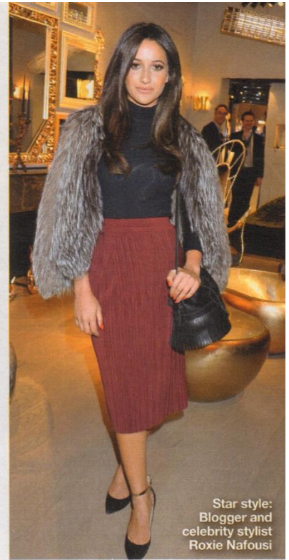
Star style: Blogger and celebrity stylist Roxie Nafousi