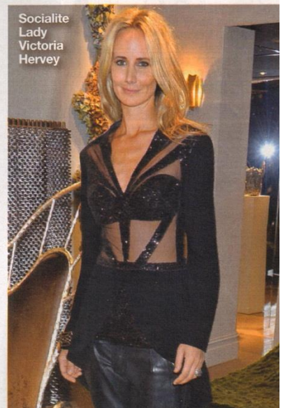
Socialite Lady Victoria Hervey