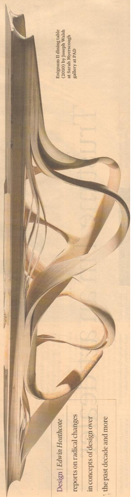
Enignum II dining table (2010) by Joseph Walsh at Sarah Myerscough gallery at PAD

Whether we think of LP covers or continued on page 2