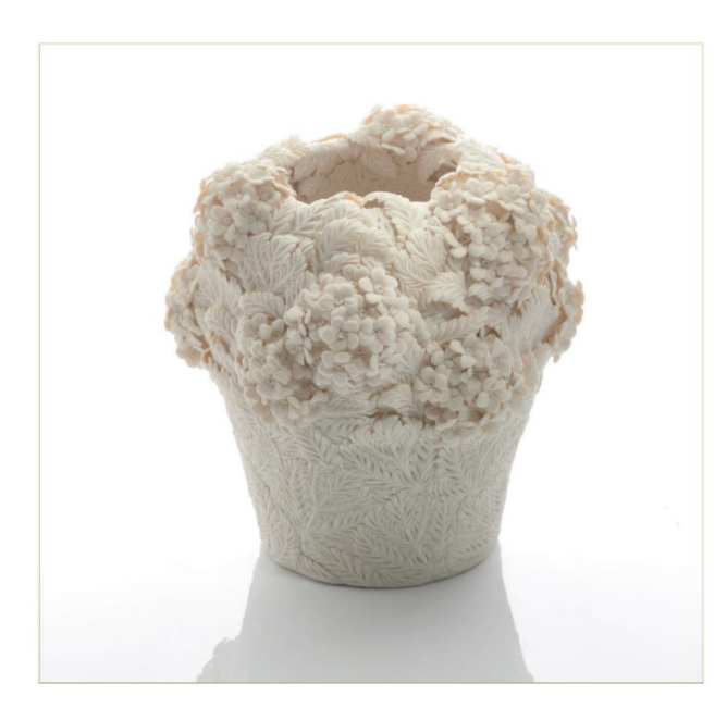
PAD London, 10 - 15 October, Berkeley Square, Mayfair, London W1

Newexhibitors include 5 newexhibitors in Contemporary Design: Galerie Philia (Switzerland, Mexico, US, Singapore), Objects With Narratives (Switzerland, Belgium), Æquō (India), Secret Gallery (France), Ormond Editions (Switzerland); 3 new exhibitors in Glass and Ceramics: Gallery LVS & Craft (Korea), Florian Daguet-Bresson (France), Raphaella Riboux-Seydoux (France); 3 new exhibitors in 20th-century Design: JCRD Design (UK), GDJ Design / New Hope (Belgium), Unforget (Belgium); and 1 new exhibitor in Collectible Jewellery: Elie Top (France).