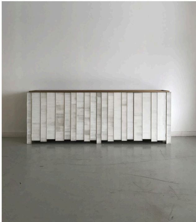
White Ice Cabinet by Jallu