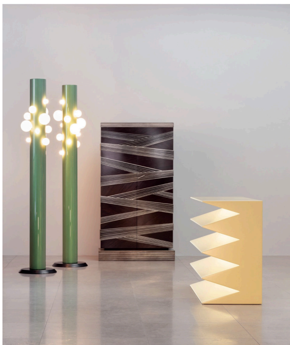
Lampadaire Electron N°589, 589, Spider Armoire N° 566, and Zappy Console Table, © Cecil Mathieu, courtesy of Hervé Van Der Straeten.