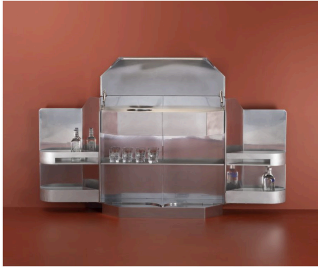
Barrha Bar by Yann Le Coadic, courtesy of Pouenat.