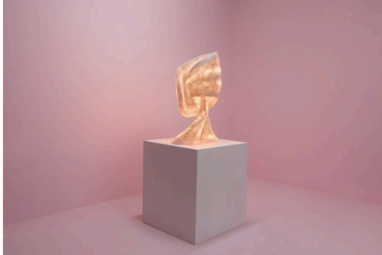
Aqua Fossil Table Lamp by Amarist Studio