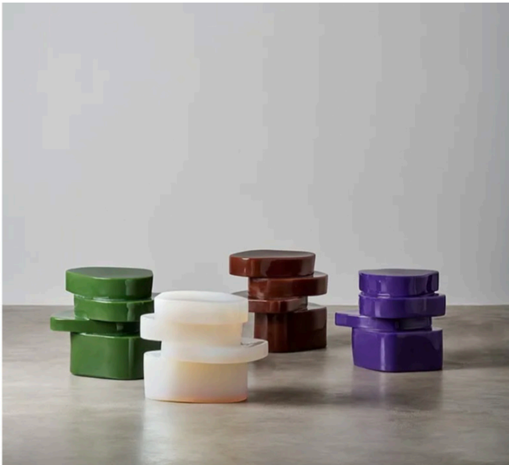
Nilufar presents a new collection by Objects Of Common Interest . 'The glazed looking objects are pigmented solid resin volumes that appear heavy and grounded and blend into the reflections of the surroundings through curves with a tactile smoothness,' say the designers