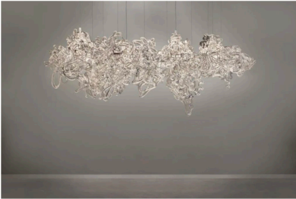
Gallery Fumi 's display includes pieces from the gallery's 15th anniversary celebration, including Stine Bidstrup's Light Entanglements chandelier