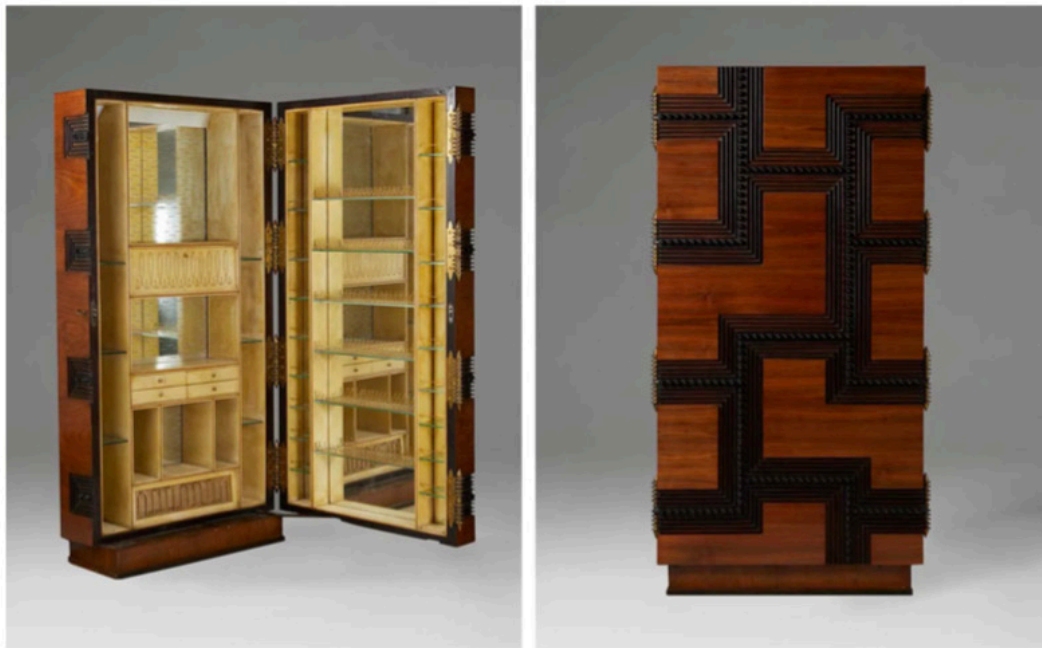
Cabinet attributed to Otto Schulz for Boet Sweden, 1935, presented by Modernity

The impressive cabinet is made from mahogany offcuts, using a by-product of the musical instrument industry generally deemed unsuitable and impractical for other uses. Neal's design celebrates the wood's irregularities through skilled use of discreet inlaid ties punctuating the large panels of the material. 'Standing at nearly 8ft in height, it is an homage to the grandiose fine furniture of eras gone by,' continues Myerscough. 'Gareth employs his deep knowledge of historical techniques to produce this exquisitely made cabinet, while commenting on the throw-away culture of the contemporary timber industry.'