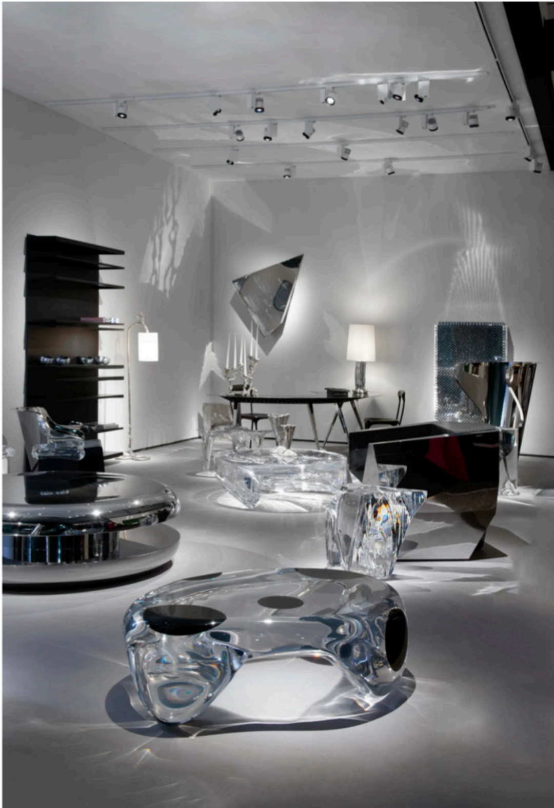
Visual contrasts are also at the centre of David Gill's display, featuring an enigmatic material mix