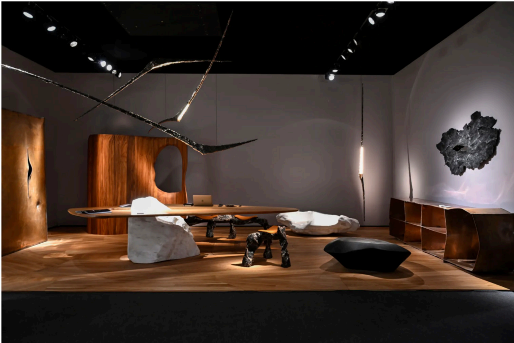
(Un-)Controlled by Objects with Narratives, featuring a curated juxtaposition of works by Mircea Anghel and Vladimir Slavov and winner of the PAD Prize for best booth

PAD London 2023 highlights – what to see as the fair returns to Berkeley square for its latest edition