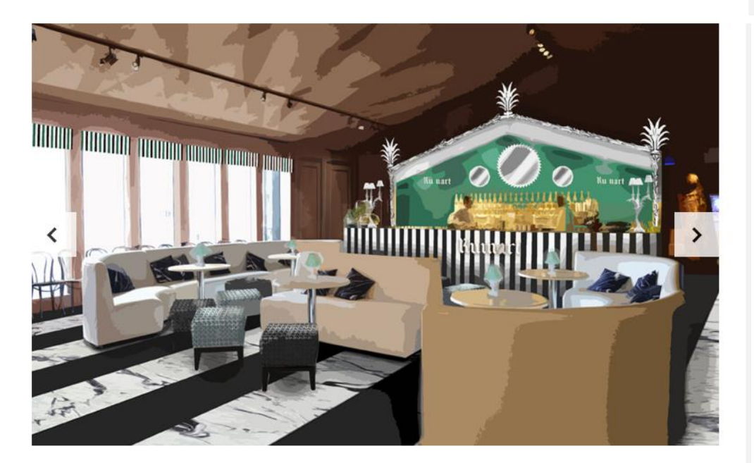
On the bar side, the room takes on a more eclectic look, with a bright emerald green wall framed by exotic plants and palm trees, and a lounge area reminiscent of Sultana's elegant interiors