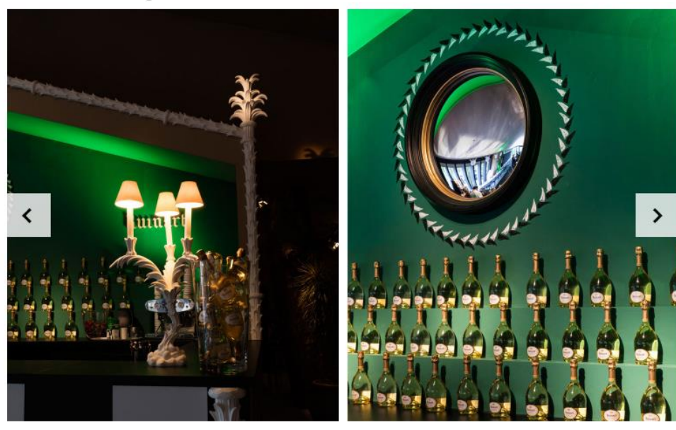
Champagne house Ruinart will take residence at the bar for the week