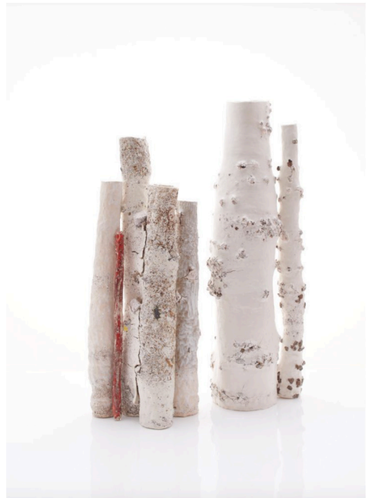
Aneta Regel, Landscape, Ceramic works