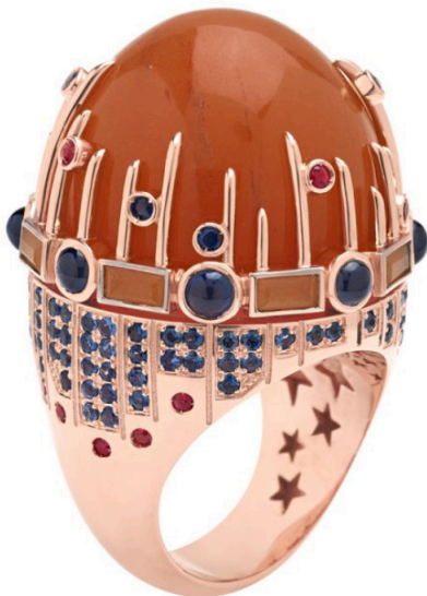
Francesca Villa, Above the Clouds Ring in orange