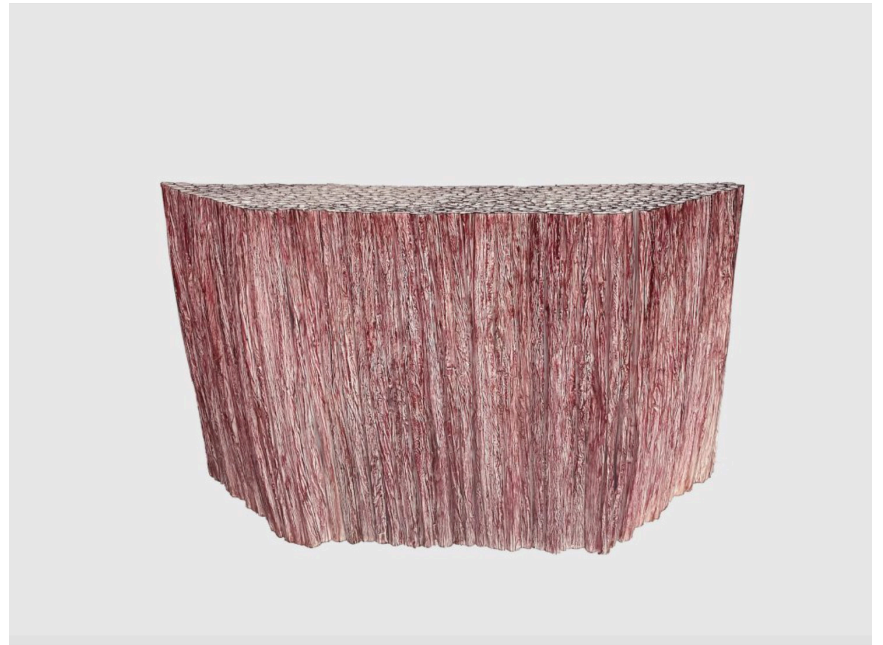
Pao Hui Kao, Red Urushi Side Board, Courtesy of the Artist and Spazio Nobile