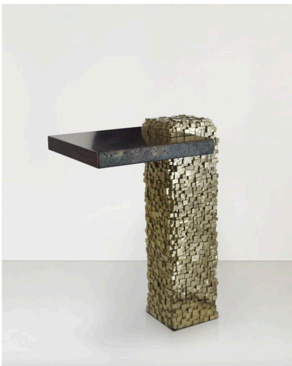
HyperFocal: O Jallu, Clement Side Table