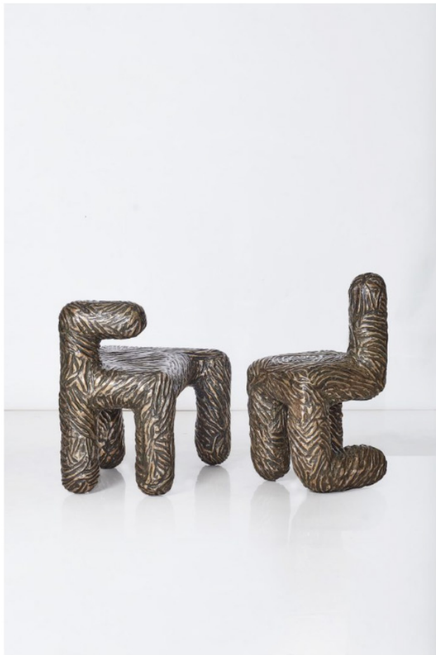
Atang Tshikare, Leng-Kapa-Leng and Yang-Kapa-Yang.