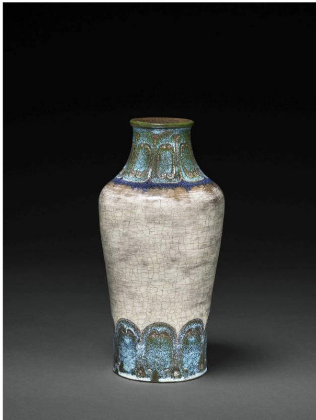
Auguste Delaherche Vase, ca. 1889 Glazed stoneware