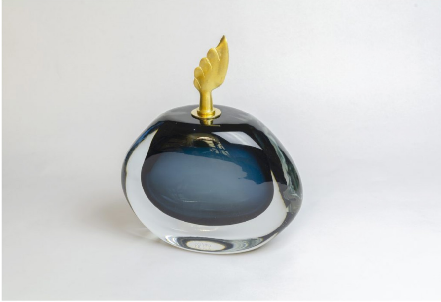
Oceano by Achille Salvagni 2019 Limited Edition of 20 pieces Height: 9" (23cm) - Width: 10" (25cm) - Depth: 4" (10cm) Hand-blown Murano glass vase with gold enameled Cast bronze candle holder and finial.