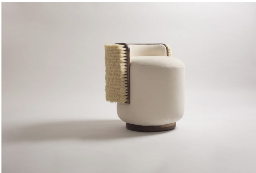
Ad Hoc ROOTS Stool beige, 2019 walnut wood, ixtle (natural fiber from agave), wool h 60 x ø 60 cm