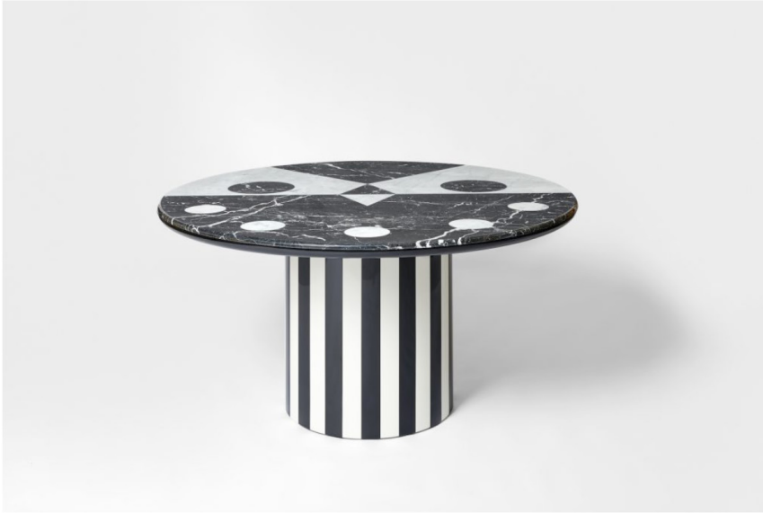
Table Niko- Niko Jaime Hayon