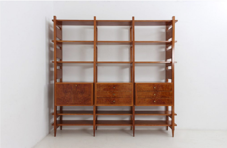
Bookcase, Gio Ponti, 1950