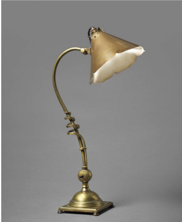
Brass Table Lamp Designed and manufactured by W.A.S. Benson (1854-1924). The original conical shade retaining its silvered interior. At the base of the stem, the original bakelite switch. English (London), circa 1900