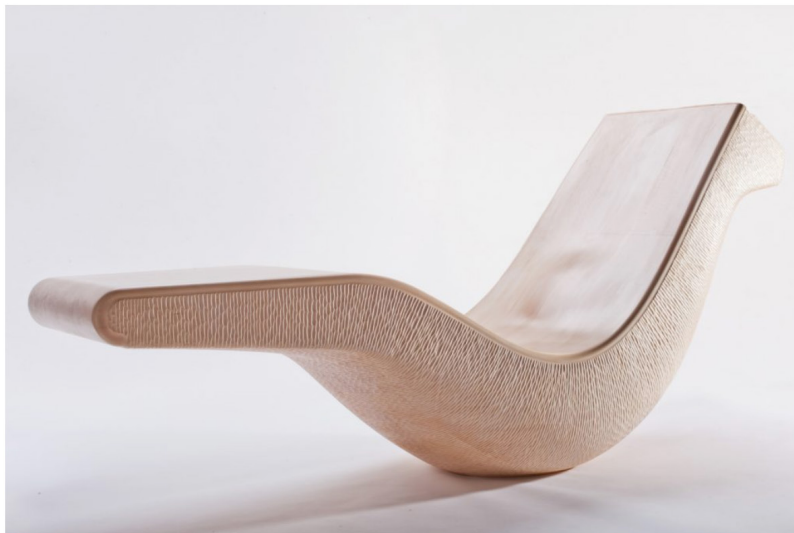
Kubu by Satyendra Pakhalé 2009 Material: limetree CNC-carved wood with hand-carved surface Edition: 7 + 3AP Measurements: W 186 x D 69 x H 86 cm (W 73.2 x D 27.2 x H 33.9 in.)