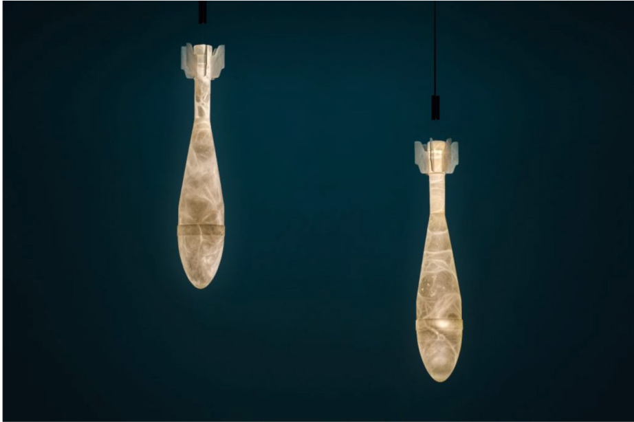
Bomb Love by Amarist Studio