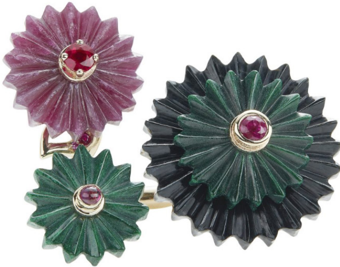
Alice Cicolini