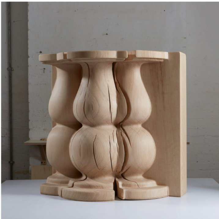
Block III by Gareth Neal