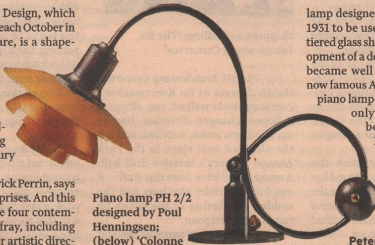
Piano lamp PH 2/2 designed by Poul Henningsen ; (below) 'Colonne sonore' (1968) by Bice Lazzari — Modernity gallery, Achille Salvagni Atelier