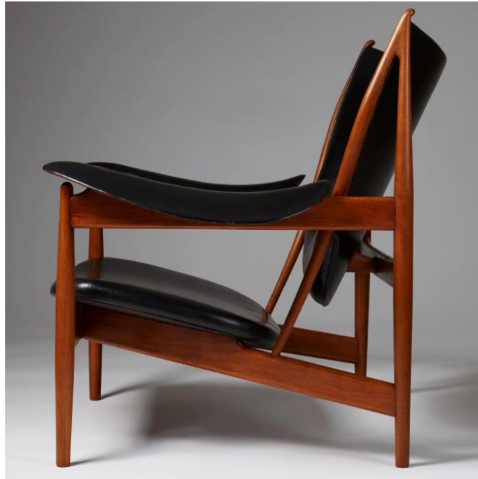
Chieftain Armchair designed by Finn Juhl for Niels Vodder Denmark, 1949 in teak and leather, exhibited by Modernity Stockholm