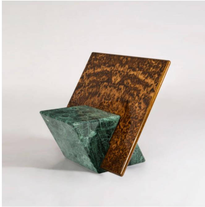
Fonteyn Chair, 2017 edition of 8 + 2AP in verde Guatemala marble and burr oak veneer by Brooksbank & Collins , exhibited by Gallery Fumi