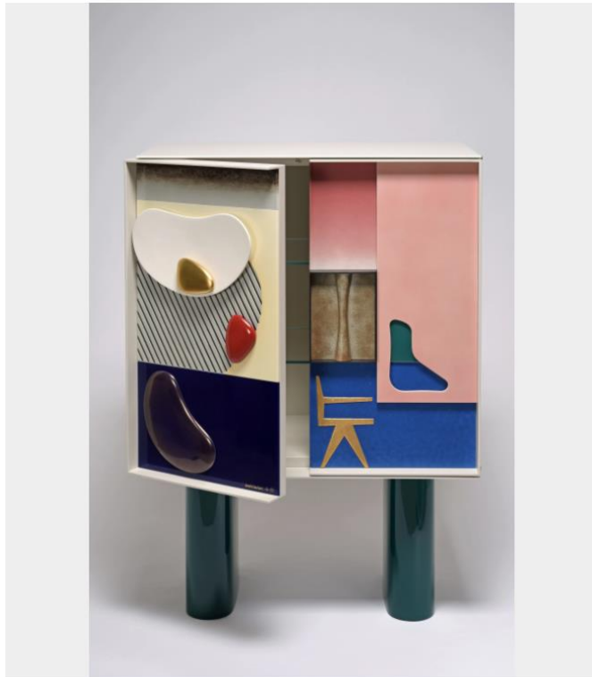
Cabinet, 2017, in porcelain, limited edition of 8 pieces, designed by Doshi Levien, exhibited by Sèvres