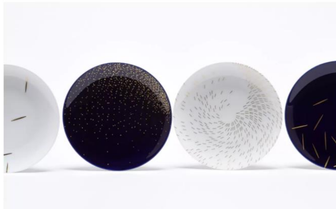
Paille, gold on white background; Galaxie, gold on Sèvres blue background; Tourbillon, gold on white background and Paille, gold on Sèvres blue background, Diane service, 2017, bread plate in porcelain, designed by Philippe Apeloig, exhibited by Sèvres-Cité