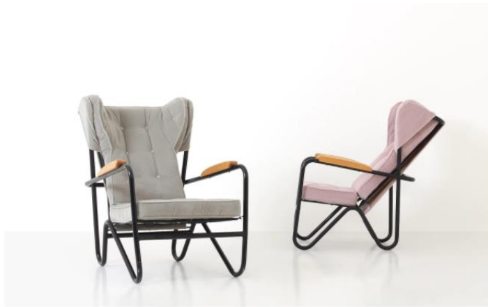
Pair of Prefacto Monsieur and Madame Armchairs in black lacquered metallic tubular structure, detached armrests with varnished wood cuff, by Pierre Guariche Produced by Airbone, exhibited by Dimore Gallery