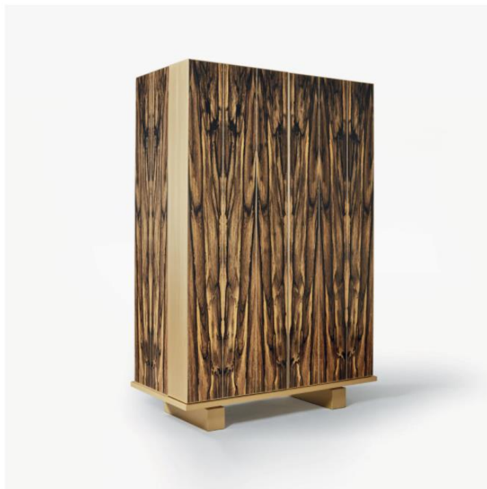
Pumage cabinet, 2017 from the Synthesis Collection in royal ebony, satined brass with sycamore interior, designed by Hervé Langlais, exhibited by Galerie Negropontes