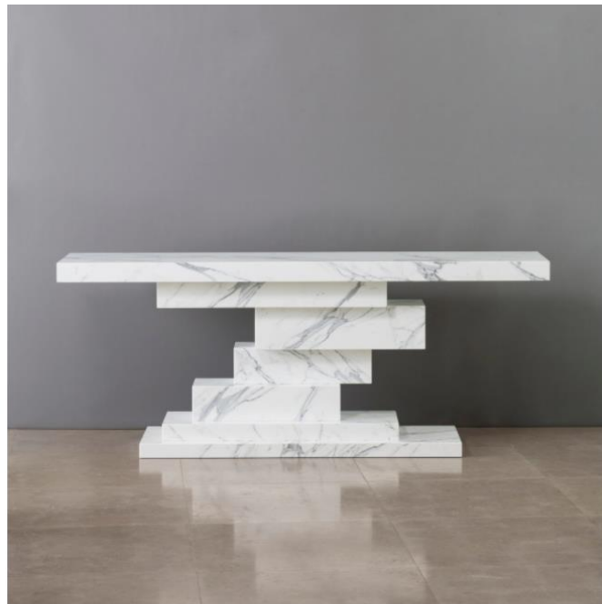
Kasimir Console in statuary white marble, edition of 8, designed and exhibited by Hervé van der Straeten