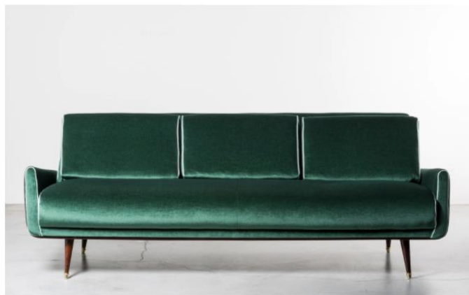
Sofa Model 801 designed by Jorge Zalsupin, Brazil 1960, exhibited by Nilufar