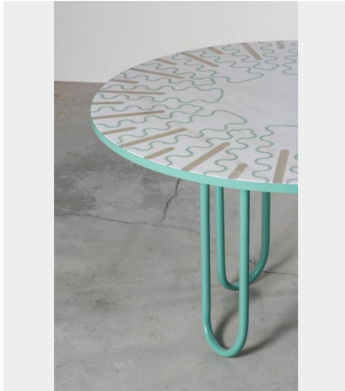
Melon dining table, 2017 in marble and steel, designed by Bethan Laura Wood, exhibited by Nilufar Gallery