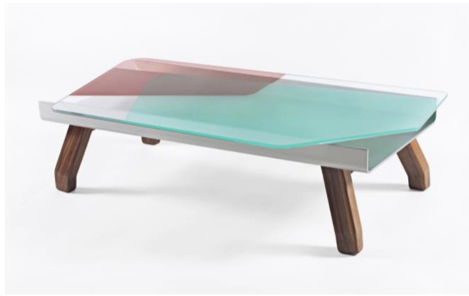
Dragonfly coffee table in green designed by Hella Jongerius , exhibited by Galerie Kreo