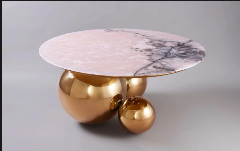
PAD London: art and design fair preview in pictures