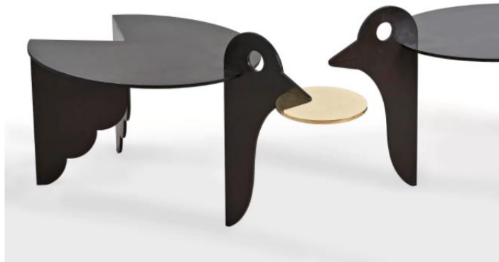
Pica et Pica d'Or Pair of low tables, 2016 all bronze, designed by Hubert Le Gall, exhibited by Avant-Scène