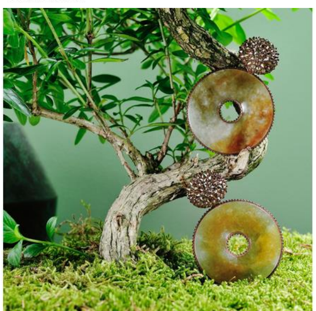
Hemmerle earrings in white gold and copper with diamonds and jade