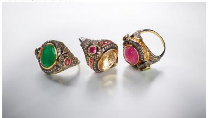
Inheritance Jewels': Victorian-era English rings inspired by Indian jewellery, in silver and gold vermeil with diamonds, ruby, sapphires, emeralds, citrines and amethysts, at Ma Tei