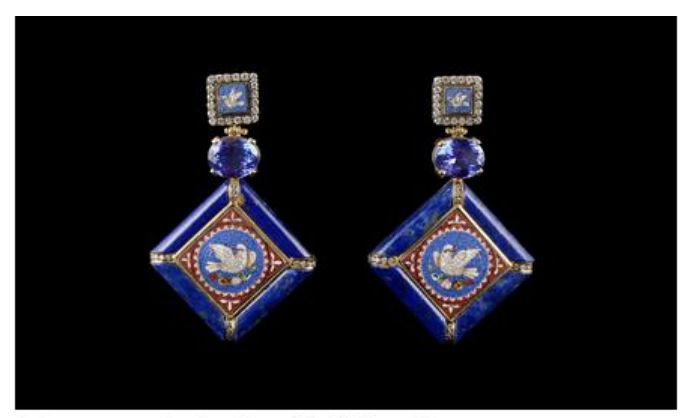
Contemporary earrings in yellow gold with diamonds, tanzanite, micro mosaic and lapis lazuli at Karry Berreby