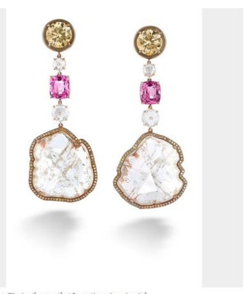
Suzanne Syz 'You're the one that I want' earrings in pink gold and bronze with diamond slices, fancy brown yellow diamonds, cushion-cut spinels, diamond discs, brown diamonds and cognac diamonds