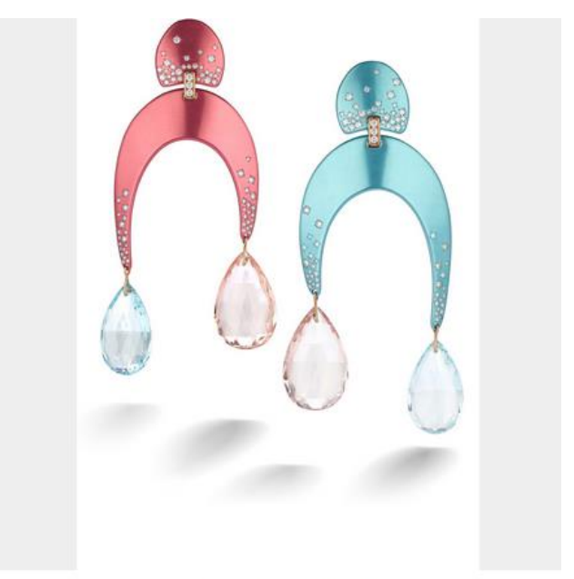
Suzanne Syz 'Are you Calder or not?' earrings in aluminium and red gold with aquamarines briolette drops and morganite briolette drops