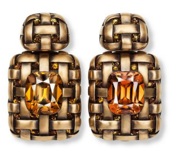
Hemmerle earrings in bronze and white gold with zircons and diamonds \,