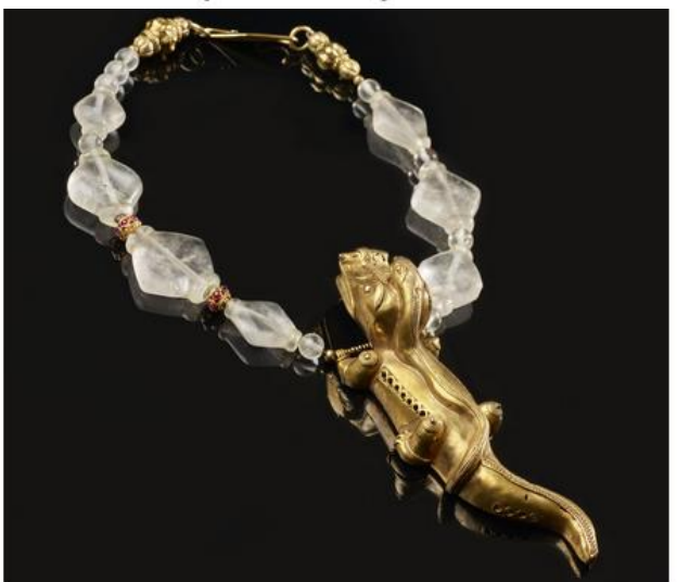
{\tt Ma} Tei necklace with 6th-12th century Zoomorph beads, crystal, gold and ruby