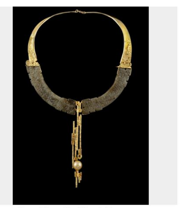
Contemporary Summer Palace necklace in 18-carat gold with pearl, jade and sapphire at Karry Berreby

CREDGE MICHEL BURNINGS INTERVINE KARRY REPORTS