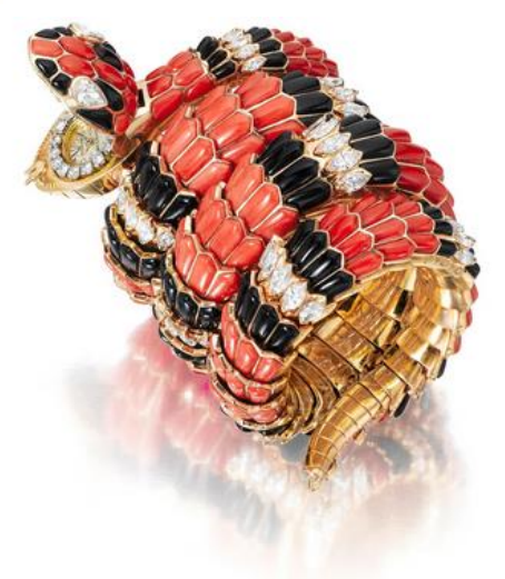
Coral, onyx and diamond Serpenti bracelet-watch by Bulgari, Italy, circa 1960, at Siegelson \,