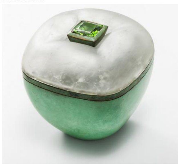
Hemmerle box in rock crystal and bronze with peridot % \left\{ \mathbf{r}^{\prime}\right\} =\left\{ \mathbf{r}^{\prime}\right\}