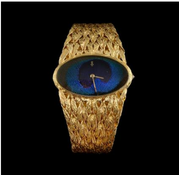
Corum 18-carat yellow gold and peacock feather watch, circa 1970, at Karry Berreby