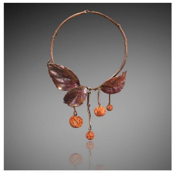
Claude Lalanne, Untitled Necklace at Louisa Guinness Gallery