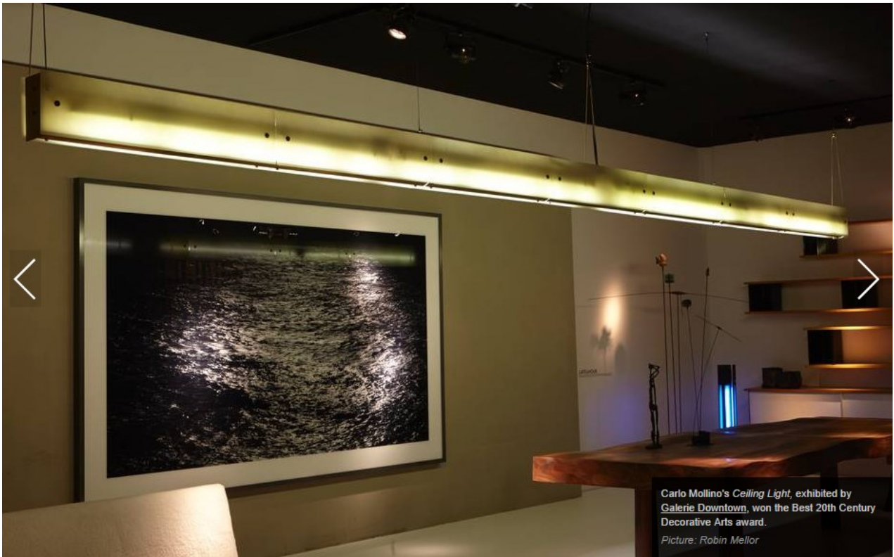
Carlo Mollino's Ceiling Light, exhibited by Galerie Downtown, won the Best 20th Century Decorative Arts award.