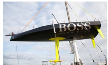
Ship shape: Konstantin Grcic fits out Hugo Boss yacht