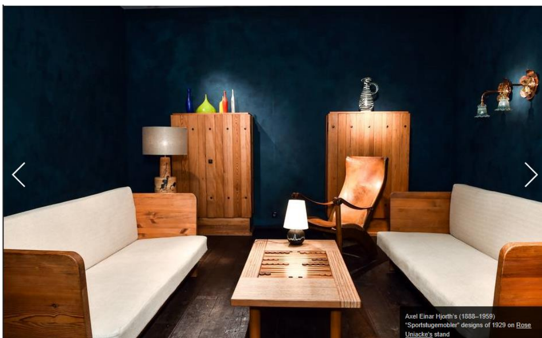
Axel Einar Hjorth's (1888–1959) "Sportstugemobler" designs of 1929 on Rose Uniacke's stand