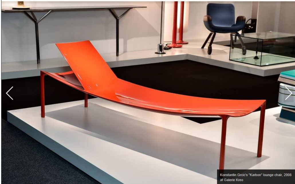
Konstantin Grcic's "Karbon" lounge chair, 2008 at Galerie Kreo