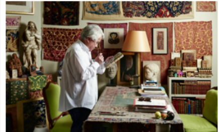
PAD's bounty hunters