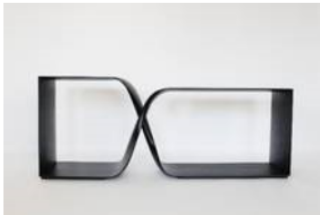
Carol Egan sculptural hand-carved 180 Twist Freestanding Console, 2015