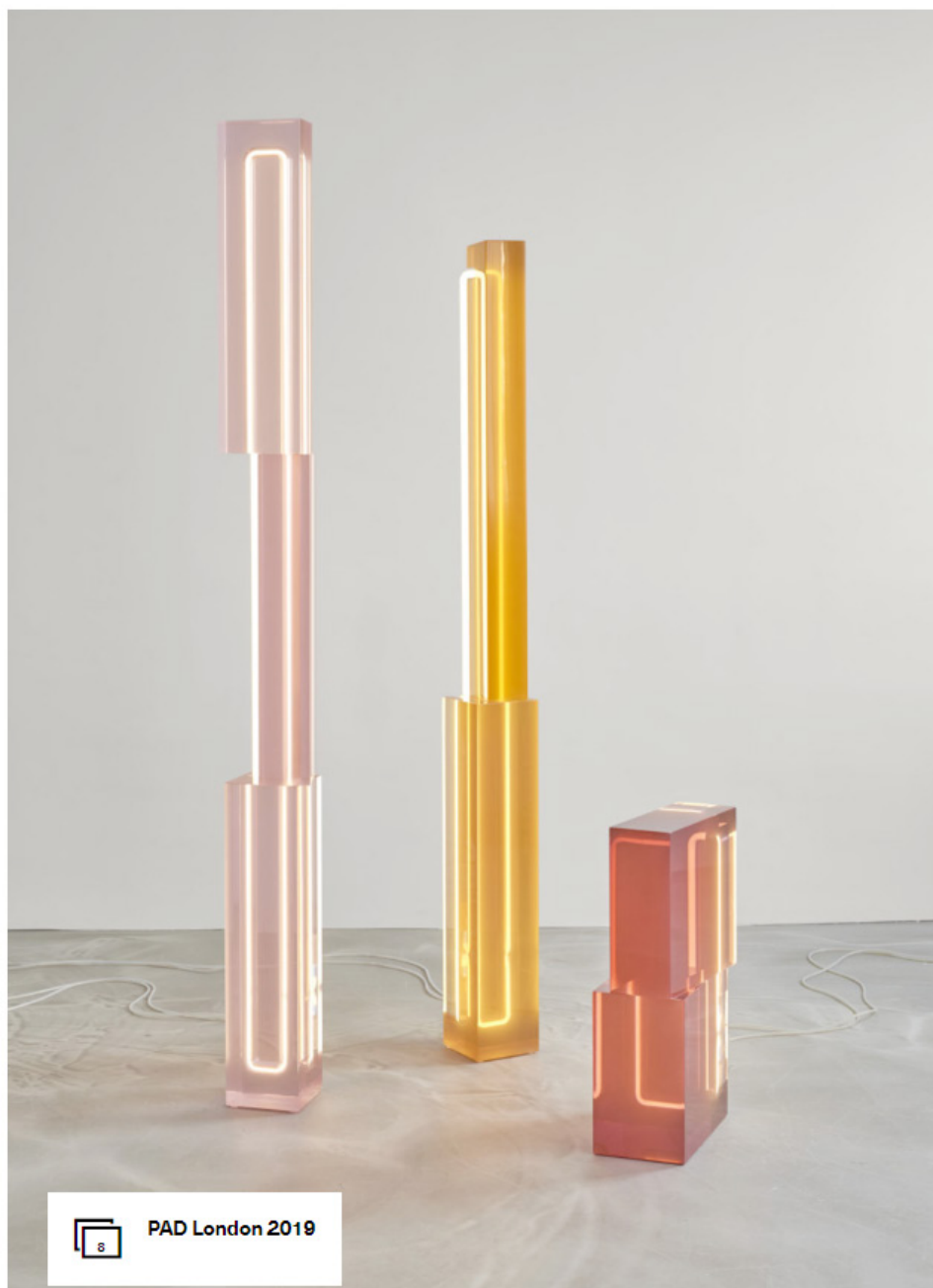
Totem by Sabine Marcellis.

Check the slideshow for what we expect will be more of the show's highlights.