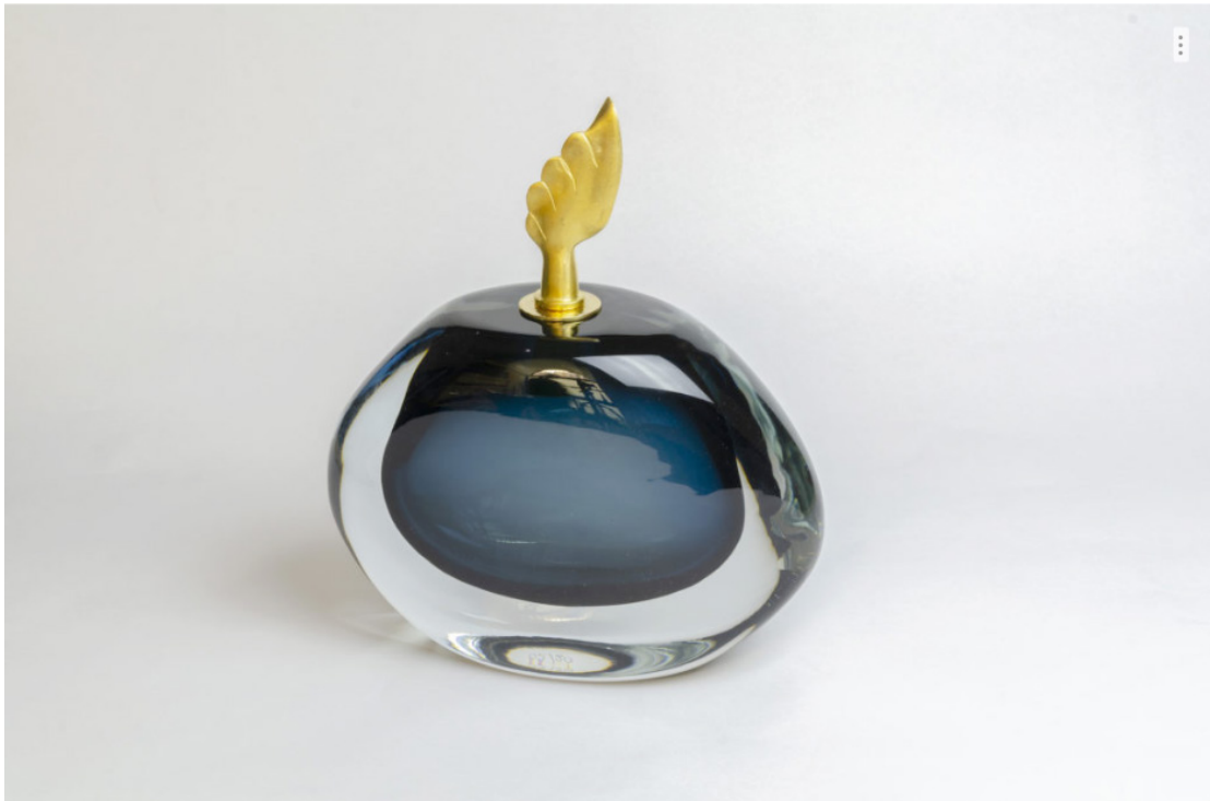
Oceano by Achille Salvagni Atelier