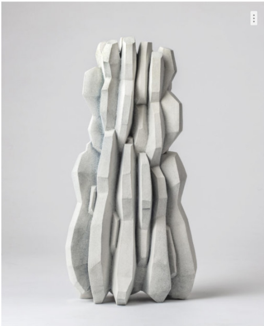
Babel by Turi Heisselberg.