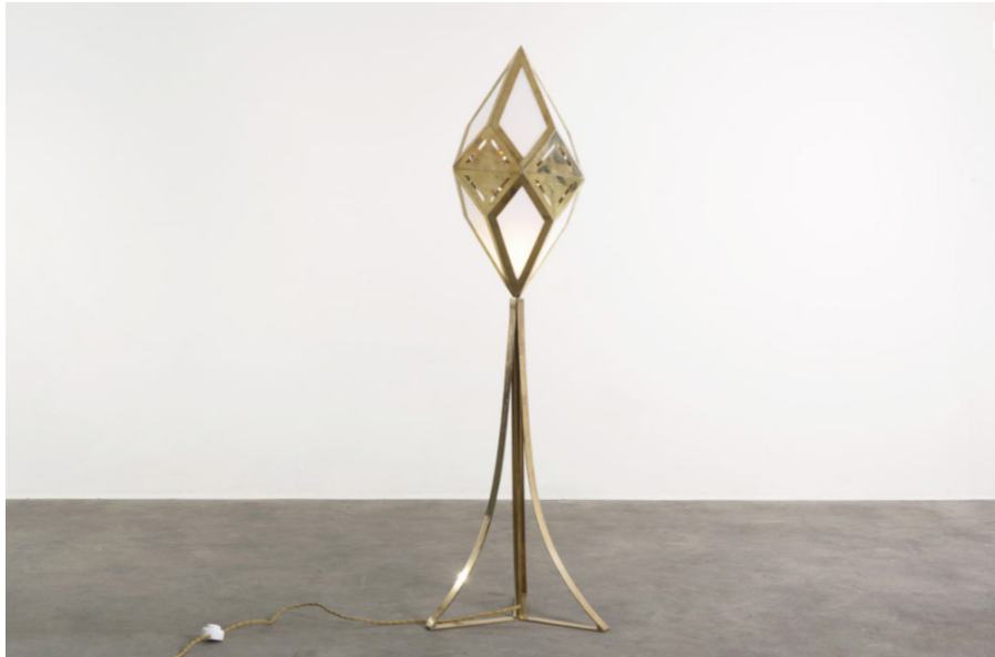
Caleidoscopio Floor Lamp by Gabriella Crespi.