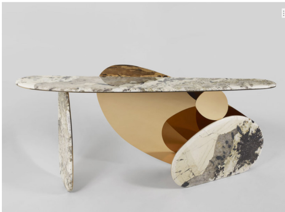
Jinye Console by Studio MVW.