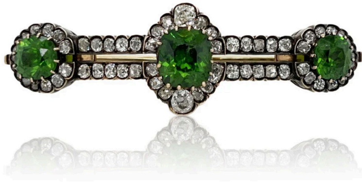
Fabergé Garnet and Diamond Brooch

Coinciding with the major fall auctions in Geneva (aka “Geneva Luxury Week”) is the fifth edition of GemGenève . Located in Hall 6 of the Palexpo convention center, just a 10-minute walk from Geneva Airport, the show is a hub for high-end jewelry designers, gemstone dealers, retailers, collectors, connoisseurs and buyers (both professional and private) in the market for exceptional gems and jewels.