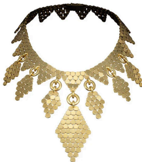
Van Cleef & Arpels Necklace from 1971