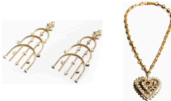
Auvere Earrings and Necklace Sotheby's