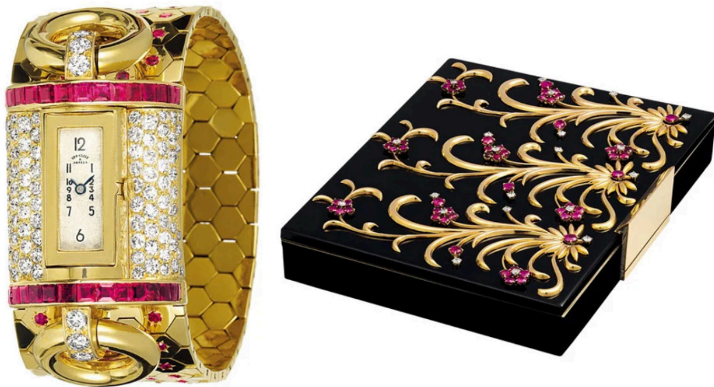
Van Cleef & Arpels Ludo Tourniquet secret watch from 1937 and Minaudière from 1939

The Design Museum in London examines Van Cleef & Arpels's bejeweled oeuvre through the lens of its quest to capture and impart movement in its creations. Featuring almost a hundred jewels from the French maison's collection, numerous archive documents and private collector masterpieces on loan, " The Art of Movement " exhibition — divided into four themes: nature alive, dance, elegance and abstract movement — illustrates the twin qualities of lightness and dynamism that have exemplified Van Cleef's designs since its founding in 1906. designmuseum.org