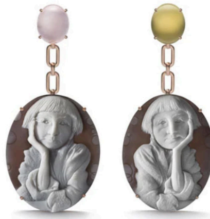
Castro Pendant; Cindy Sherman Earrings PAD London