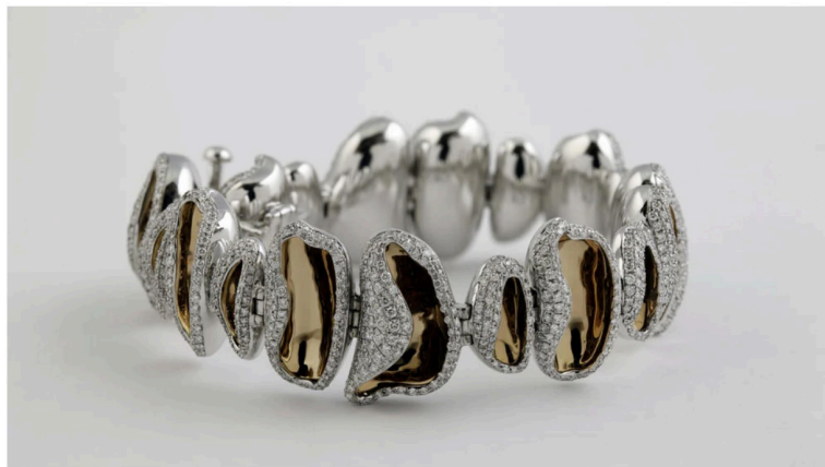
Studio Renn bracelet in 18-karat white gold, yellow gold and diamonds

For the fifth time, NYC Jewelry Week , an annual weeklong celebration of jewelry that's free and open to the public, takes Manhattan. "Attendees can expect retail activations, exclusive interviews, panels, open studios, and pop-up exhibitions from designers, jewelers, artists, and galleries from across the globe," says co-founder Bella Neyman. "New this year: REEL Jewels, a film program highlighting jewelry on film and consumer activations like upcycling your jewels, appraisal services and consignment tutorials." Plus: NYCJW's online platform Exhibitionist returns with a feature on six fine jewelers curated by author, curator and jewelry historian Melanie Grant (of "Brilliant & Black" fame). Not in New York? No problem. The program will stream virtually on NYCJW's YouTube channel and Instagram. nycjewelryweek.com