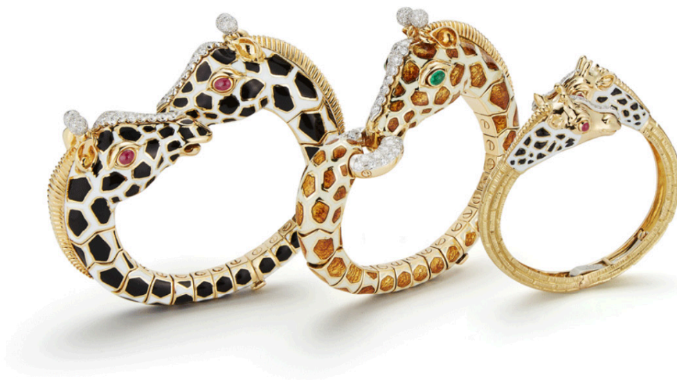
David Webb Giraffe Bracelets David Webb