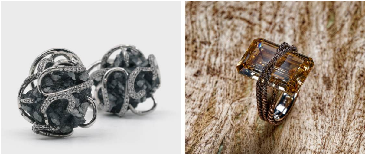
Images: Concrete Remnant Earrings by Studio Renn (Superjewellers by Valery Demure) and Hemmerle ring , diamond, bronze, white gold (Hemmerle)

hued to complement the stone's colour, as well as a rare emerald ring weighing over 16 ct., set off-centre in a diagonal axis in sculpted bronze and white gold.