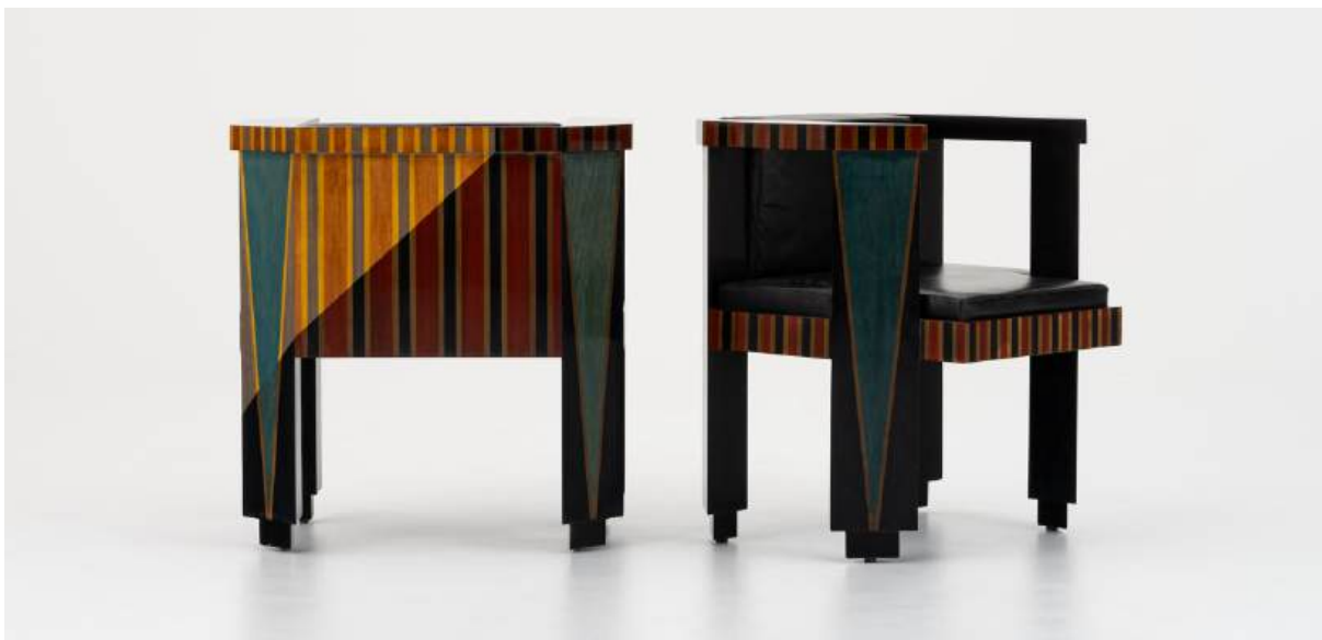
Image: Diderot armchairs (1986) by Guy de Rougemont (Galerie Gastou)

Among this year's highlights is a wealth of French mid-century icons. Portuondo Gallery (London) will showcase innovative and timeless mid-20 th century French modernist designs, including the Taureau Totem (c.1968) by brothers Robert and Jean Cloutier, the rare fiberglass Boomerang desk (c.1969) by Maurice Calka, and a walnut and brass console table (c.1951) by Ico Parisi.