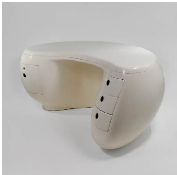
Images: Double-counterweight floor lamp (c.1951) by Pierre Guariche (Galerie Meubles et Lumières) and Boomerang desk (c.1969) by Maurice Calka (Portuondo Gallery)