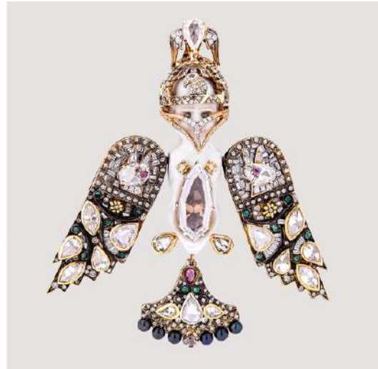
Images: Diamond Twist Bracelet & Ring from the Twist Collection (Elie Top) and Falcon Crest Pendant by Castro NYC (Carpenters Workshop Jewellery)