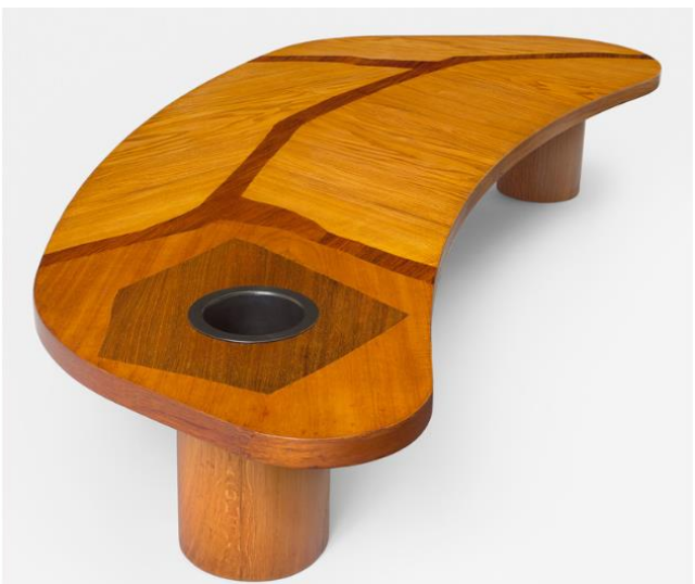
Image captions: Ceiling lamp model A203 by Alvar Aalto for Valaistustyo (Modernity), Cachalot low table by Jean Royère (Galerie Jacques Lacoste)