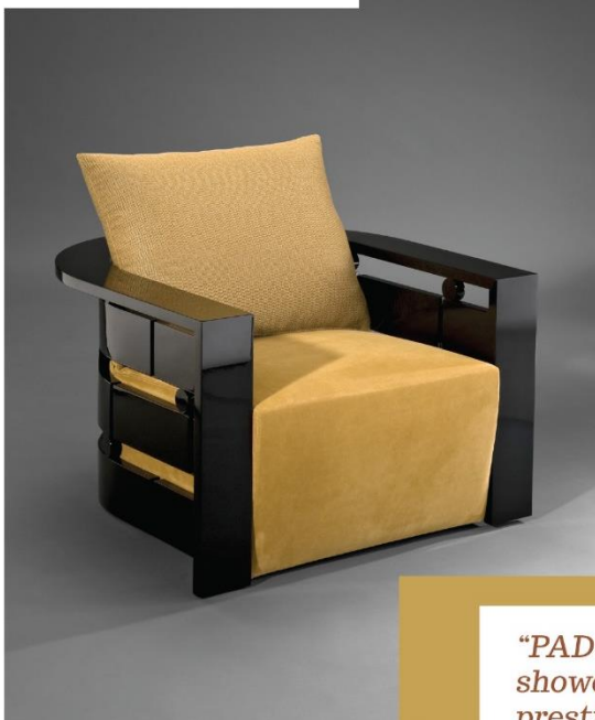
BELOW: Boa Vista

groove and imperfection. London designer Christopher Duffy combines art and function in his pieces, playing with concepts of gravity, geometry and illusion. Everything is handmade to order in the UK, using sustainable wood and other eco-friendly materials. Myerscough will bring pieces such as Abyss Console Table , 2016 – a solid wooden table with rippled edges and a resin, glass and acrylic blue top that is reminiscent of the sea edging away at a cliff edge.