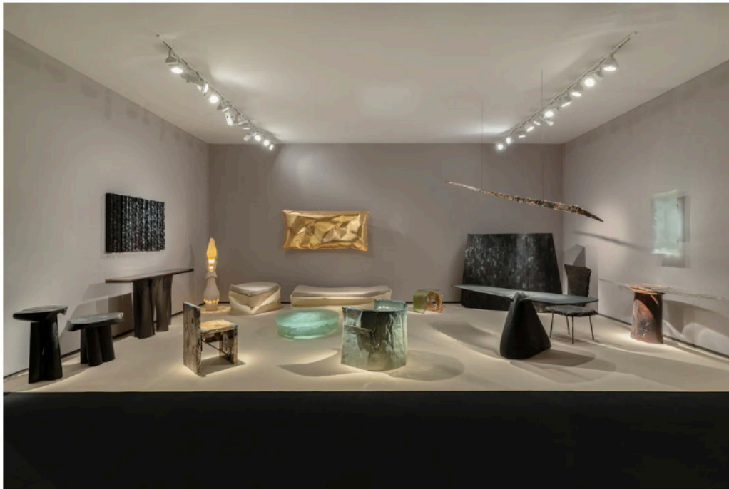
The Objects With Narratives booth at PAD London 2024

In just two years, Objects With Narratives had become a force to be reckoned with in the world of contemporary sculptural design. Their collection The (Im-)Perfectionists captivated PAD visitors with its bold exploration of imperfection in design. The Aquilon Bar Cabinet by Maison Jonckers stood out, blending bronze craftsmanship with Wabi Sabi-inspired etchings, asymmetrical doors, and rough edges that created a tactile and visually striking experience.