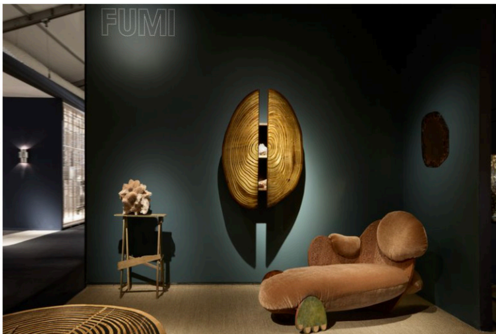
Gallery FUMI at PAD London 2024