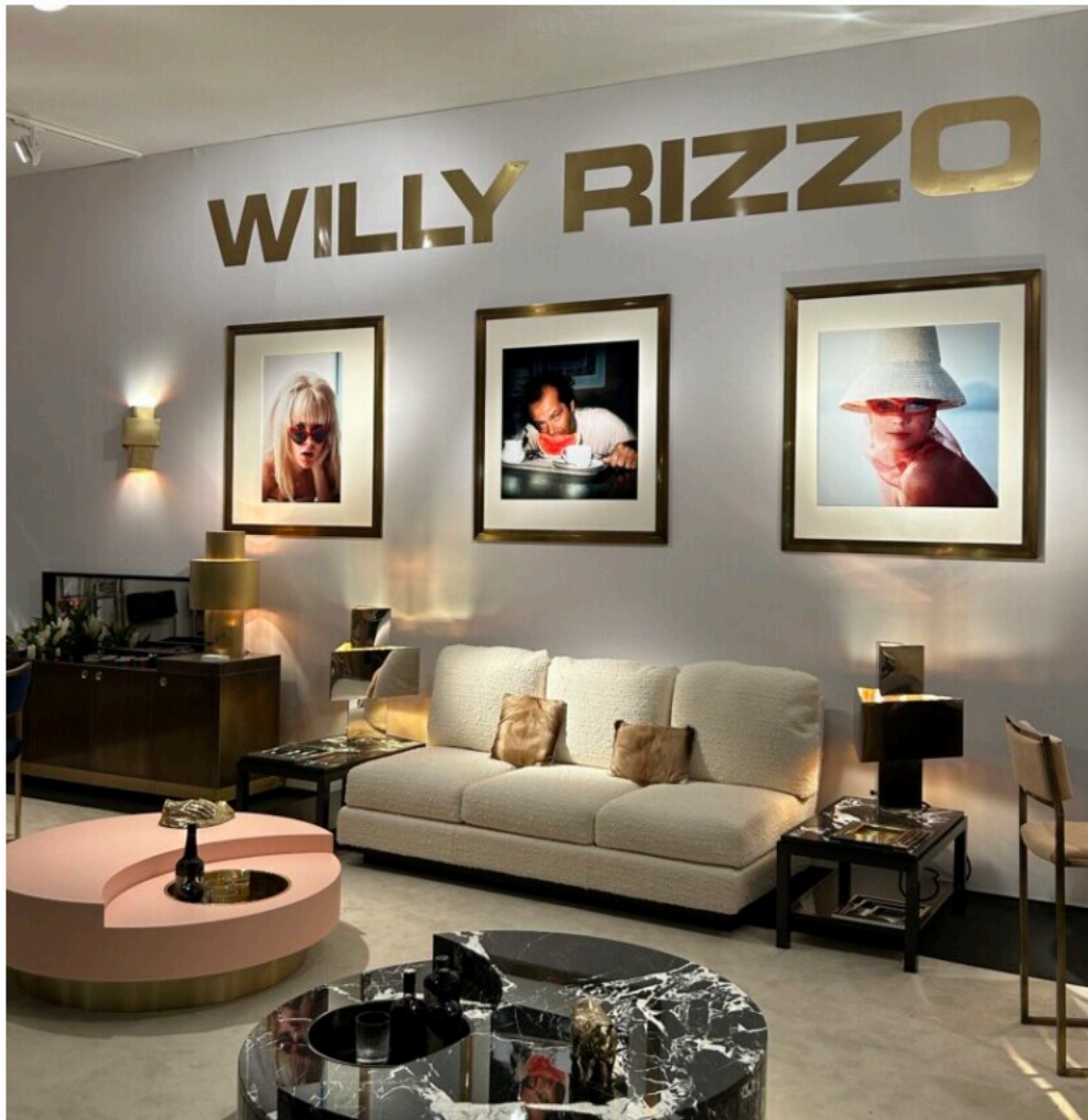
Willy Rizzo booth at PAD London 2024