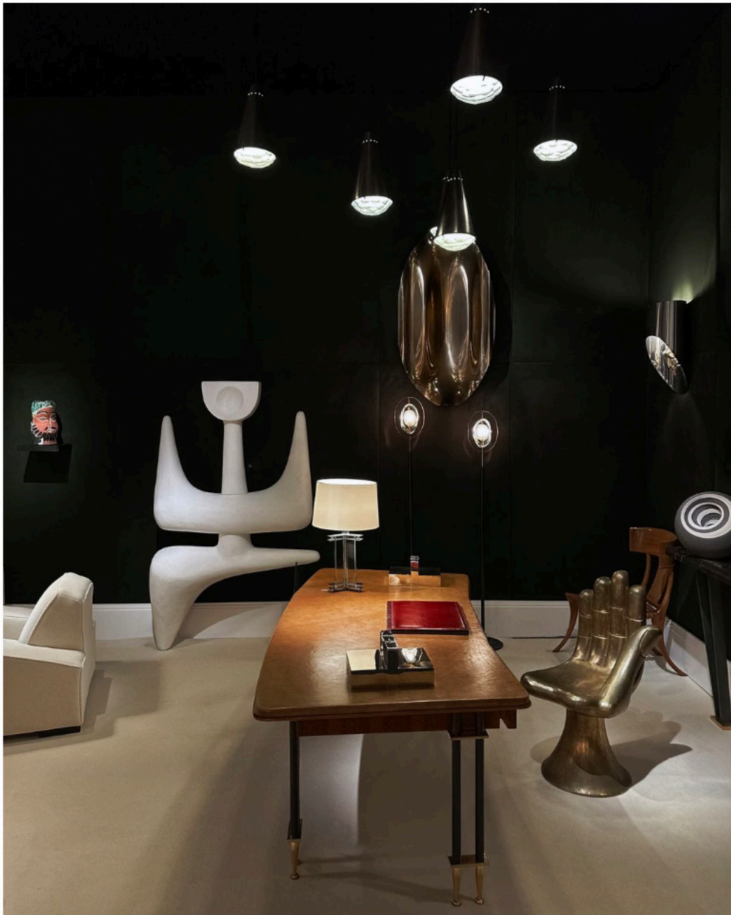
Portuondo Gallery at PAD London 2024