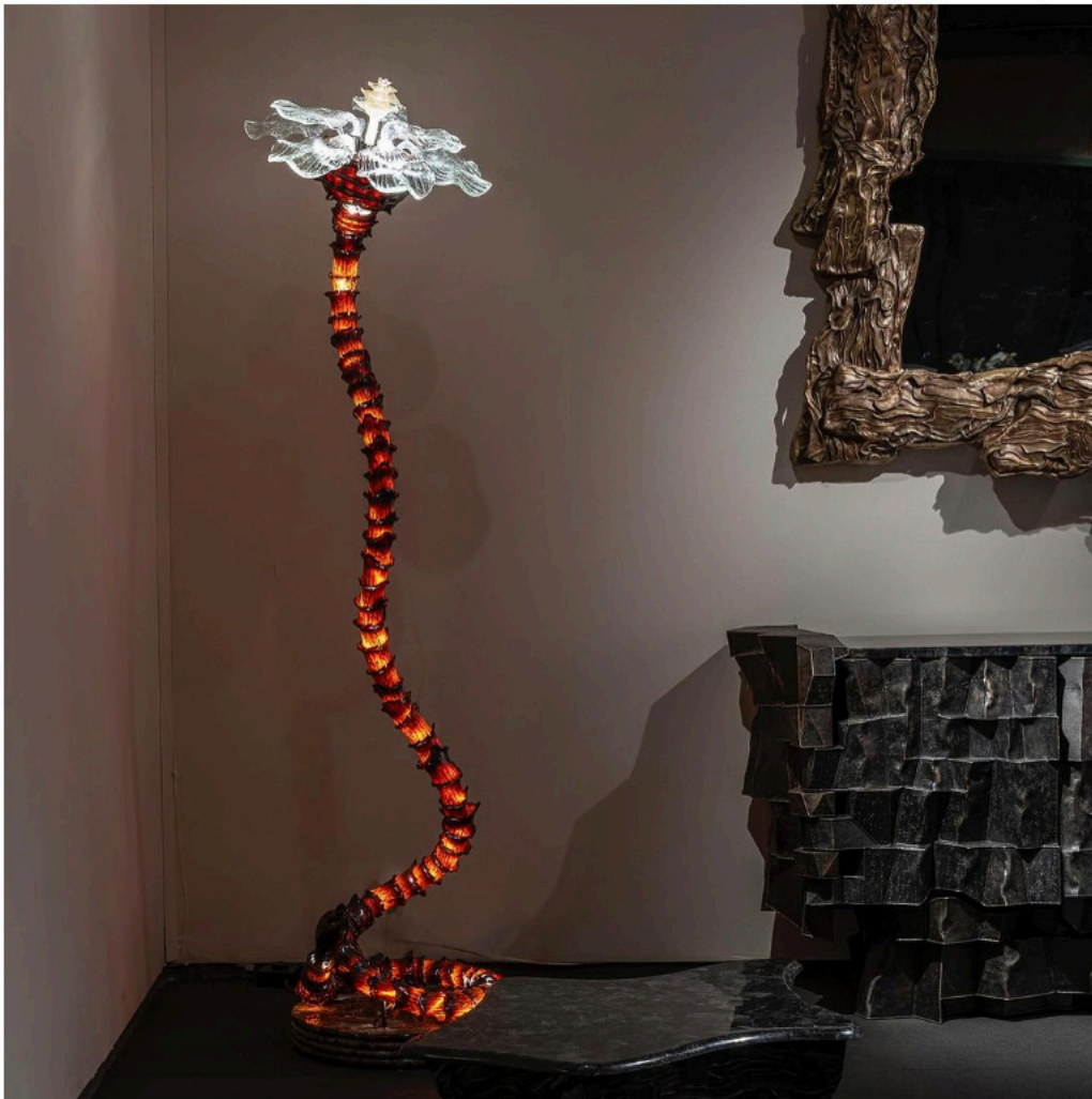
Vikram Goyal x Nilufar at PAD London

Founded by Nina Yashar in 1979, Nilufar had long been a powerhouse in the design world. At PAD 2024, the gallery presented a dynamic blend of mid-century and contemporary pieces, offering a cross-cultural perspective that bridged eras and styles. The Vikram Goyal X Nilufar booth, a collaboration with the New Delhi-based designer, showcased monumental metal furniture, while Nilufar's own booth highlighted key mid-century works, including a Brazilian rosewood Capri table by Jorge Zalsupin and a Gabriella Crespi lamp from the 1970s.