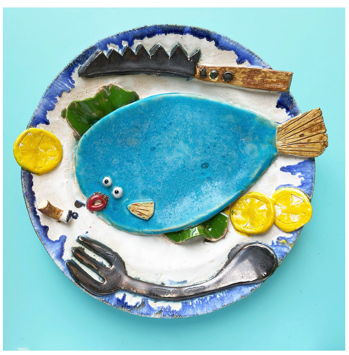
Assiette de la mer by Superpoly.