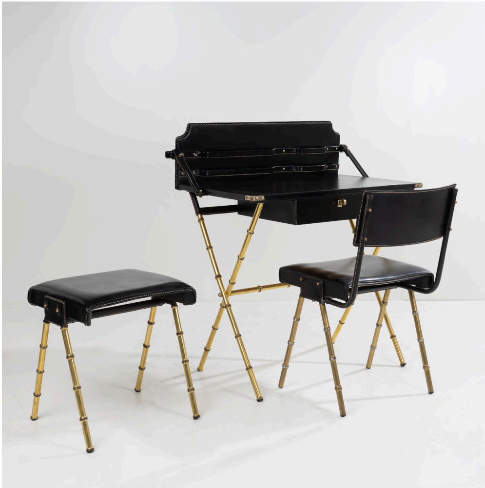
Drop-leaf desk with its seat and visitor's stool by Jacques Adnet on display at Unforget.