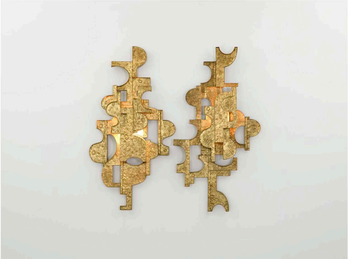
Picasso Quatret sconces by Vikram Goyal.