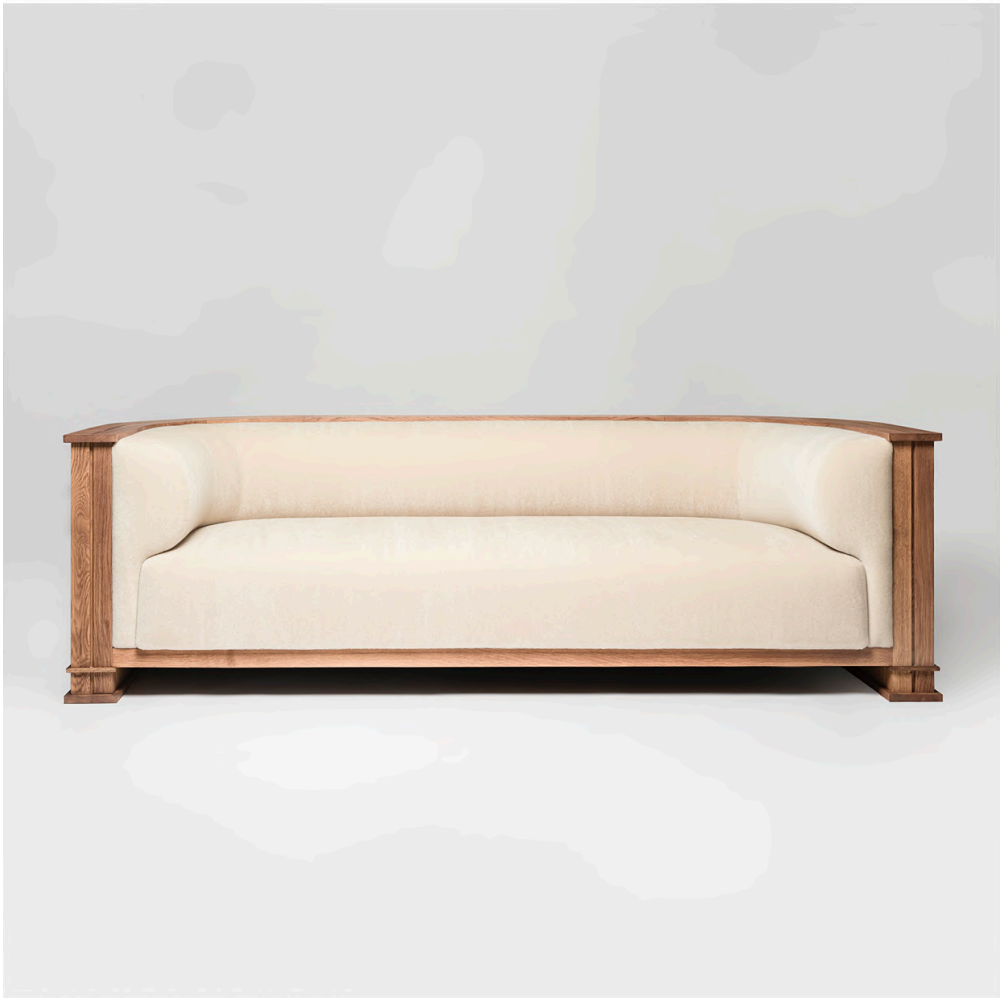
Otto Méridienne by Valérie Lazard x Ormond Editions.