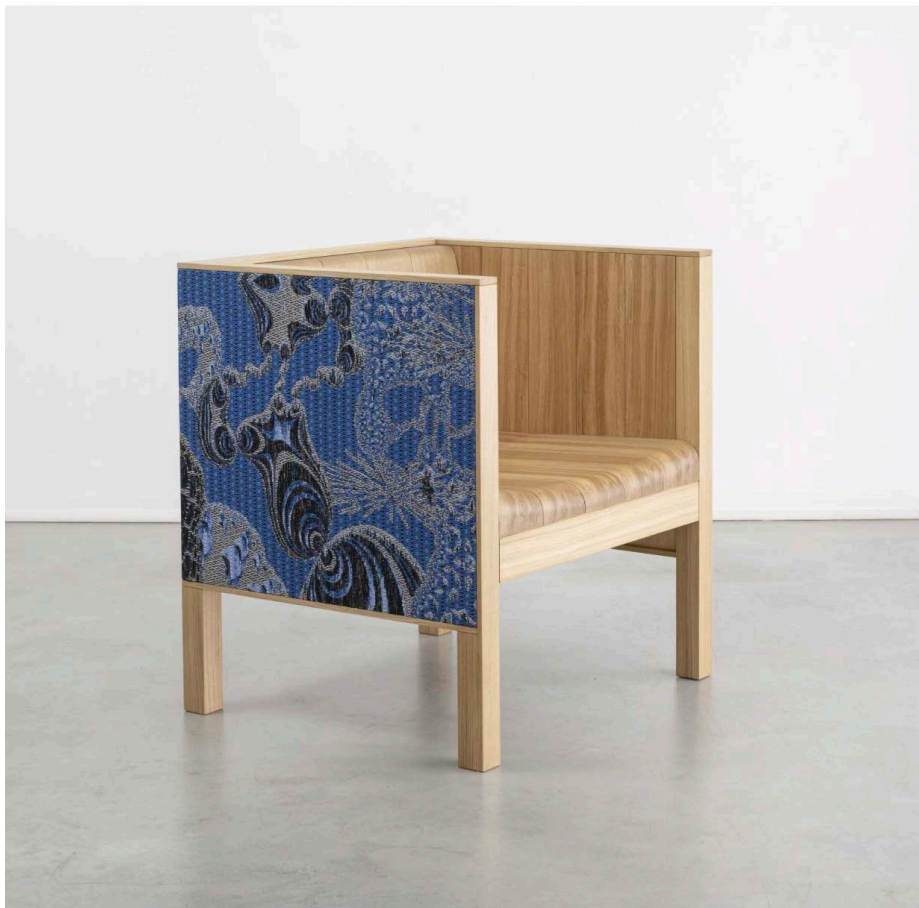
Pitkä Kotka by Kustaa Saksi (2023).