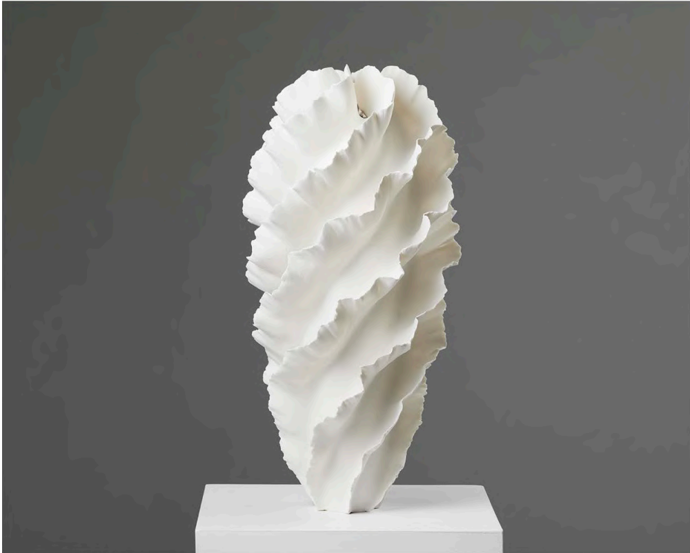
Vessel by Sandra Davolio.