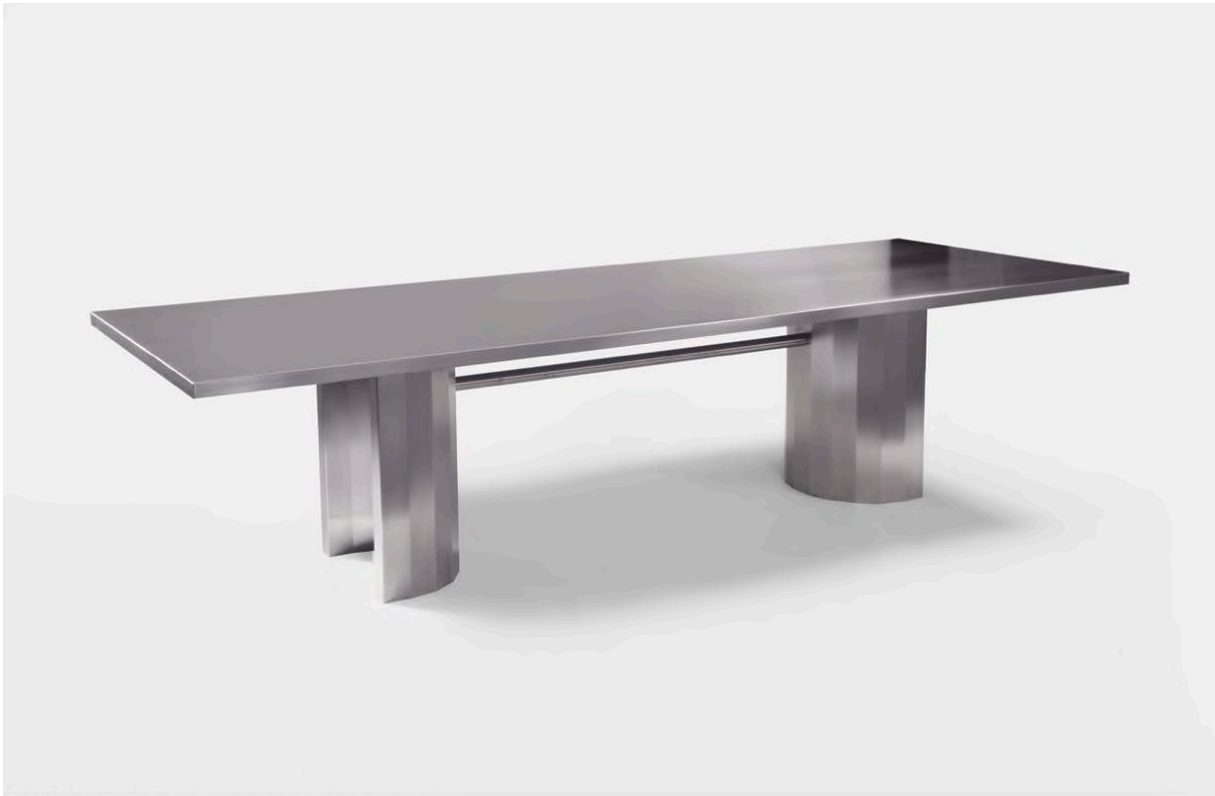
Romane table by Garnier Linker.