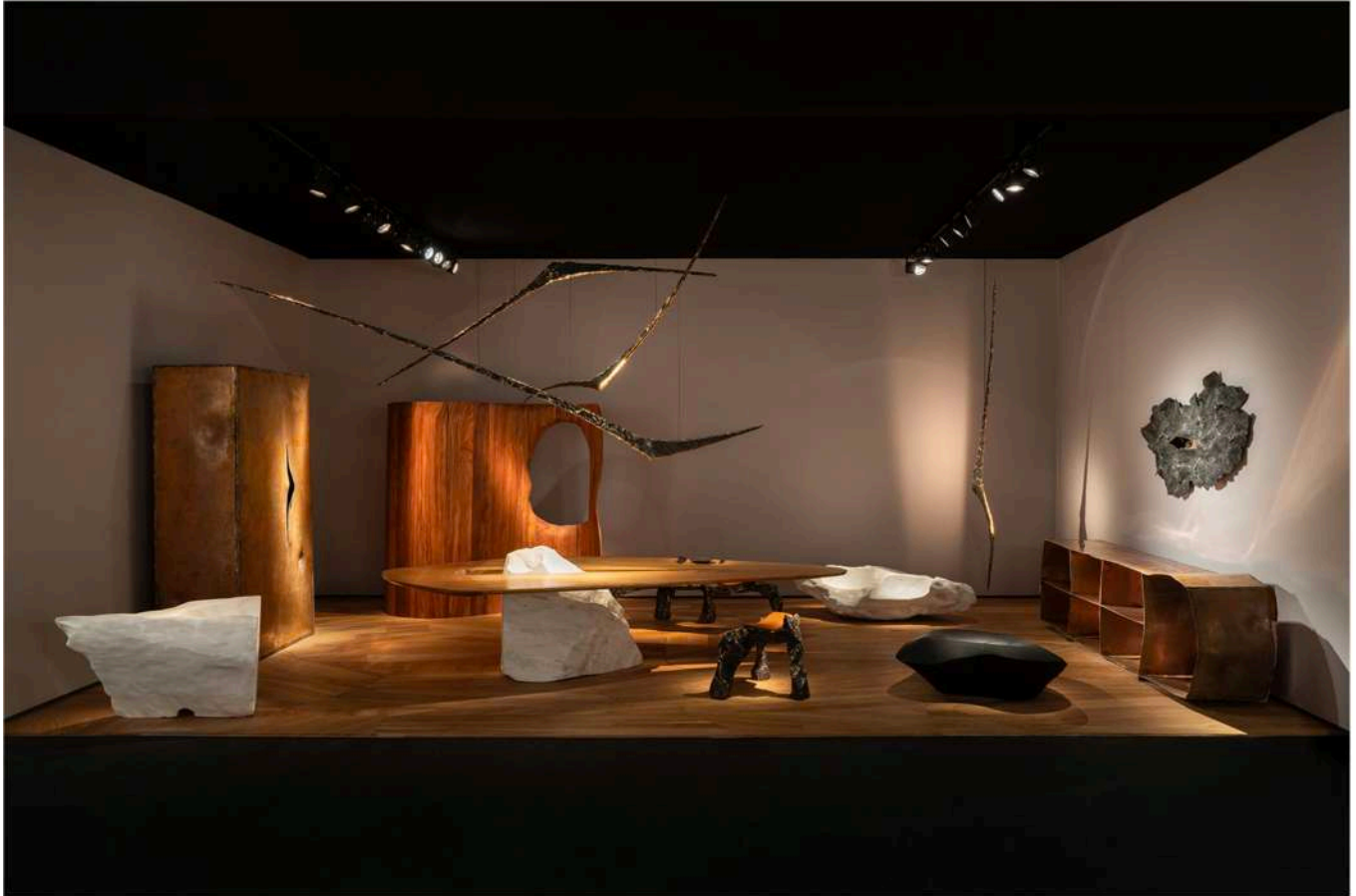
Objects with Narratives' booth at 2023 PAD London.