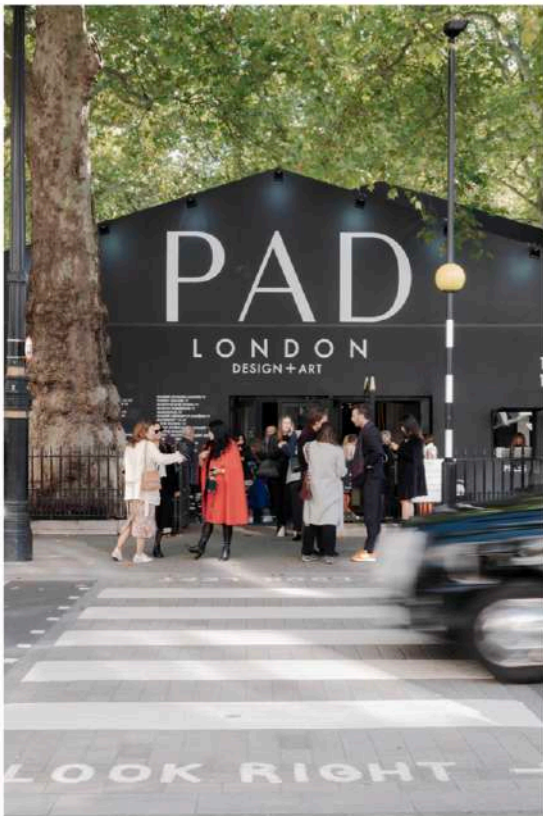
PAD London.

On October 10, throngs of well-heeled guests made their way to the black tent that had been erected in Berkley Square, right in the heart of London's elegant Mayfair district, for the opening of the 15th edition of PAD London , the acclaimed art and design fair. Inside was a treasure trove to be discovered, representing the very best in art, design, jewelry, and antique objects from 62 leading galleries around the world.