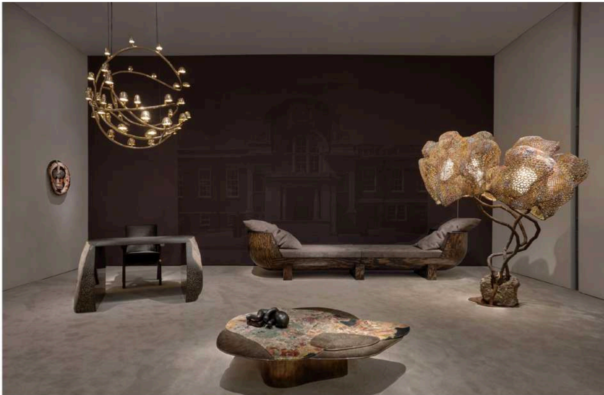
Installation view of Carpenters Workshop Gallery at 2023 PAD London.

In a booth curated by Nilufar, leading Indian designer Vikram Goyal is showing collectible design pieces that demonstrate his New Delhi-based workshop's mastery of metal.