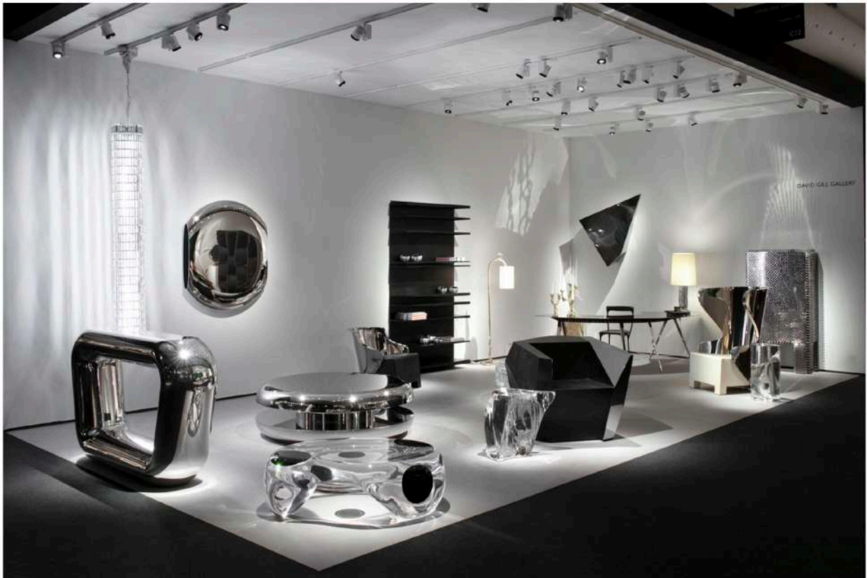
David Gill Gallery's booth at 2023 PAD London.

Carpenters Workshop Gallery's presentation centers on the artists who have shaped the creative environment of Ladbroke Hall, the new home of the gallery's London location that opened earlier this year. A highlight is Flood Tree (154/2019-2023) , 2019, by Nacho Carbonell, a dazzling light sculpture crafted in metal mesh with paverpol and pigments.