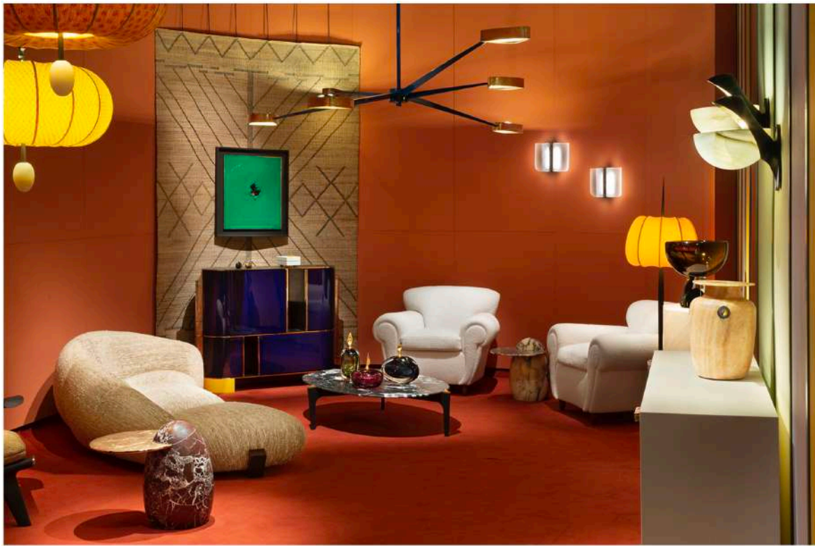
Achille Salvagni Atelier at PAD London.