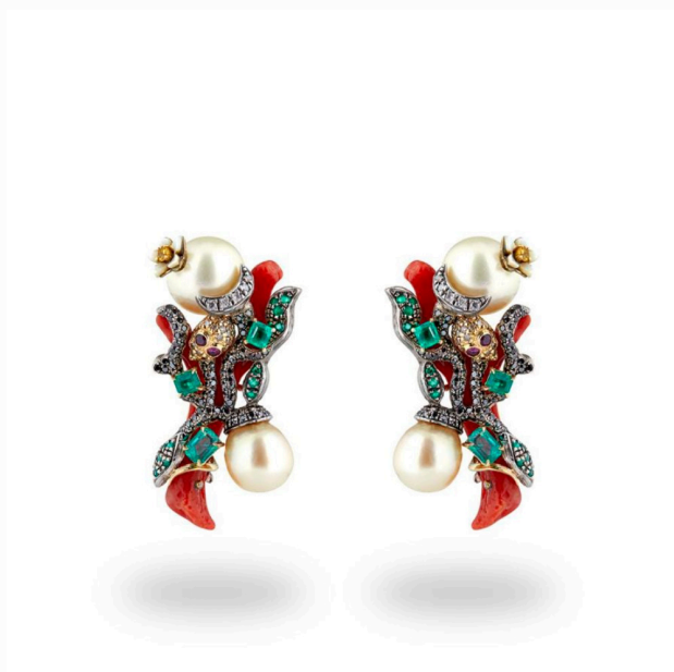
Abstract earrings by Castro NYC; coral, rubies, white diamonds, 18kt yellow gold, sterling silver, ... [+] WWW.ONURODUNCULAR.COM

"Similarly to the artist's sculptural work, the ring addresses the relationship between man and nature," says Cipriani. "Penone opted for a highly realistic representation, reproducing with exquisite precision and craftsmanship the structure of the sage, with a musical note representing a breath among the leaves. By juxtaposing the organic and the musical, Penone invites us to immerse ourselves in the melody of nature, to bring back the sound of the wind among the trees and the rustling of leaves."