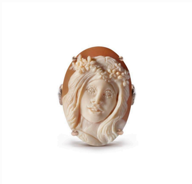
The Halo ring by Cindy Sherman, 18kt pink gold, natural yellow diamonds and cornelian shell,... [+]