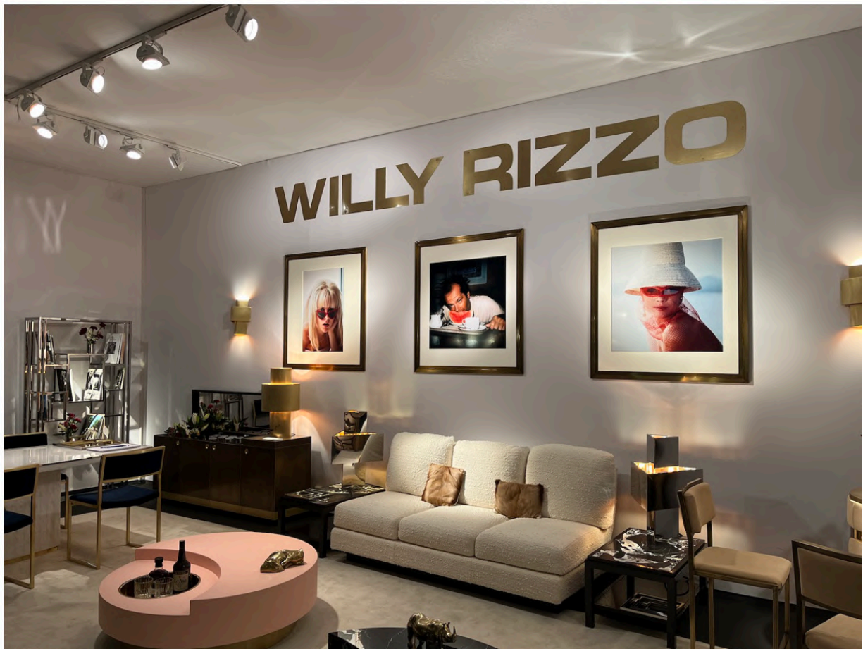
Willy Rizzo at PAD London 2023