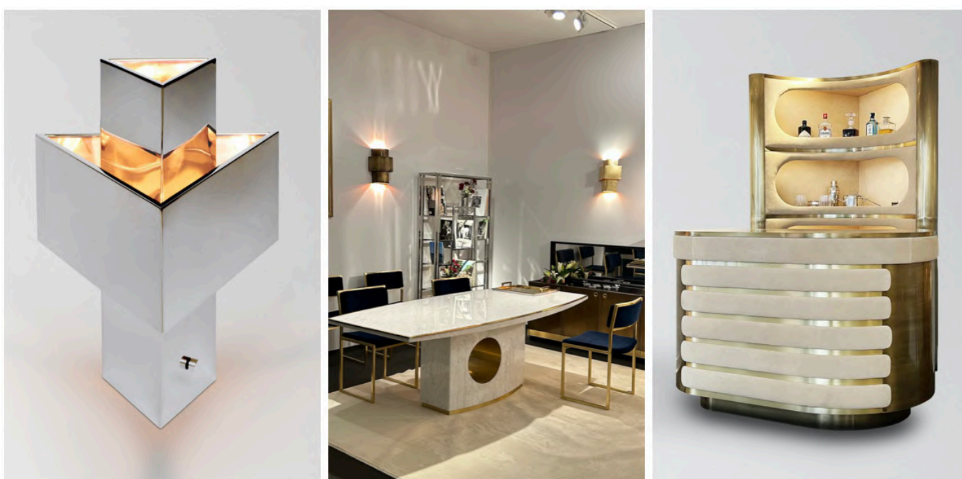
Love Lamp Triangulaire, Opal Table and Bar Furniture at Willy Rizzo