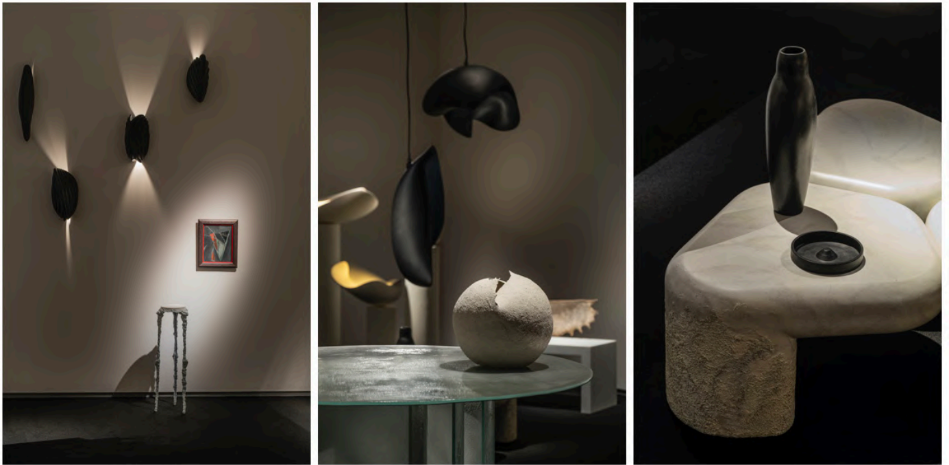
Galerie Philia at PAD London 2023