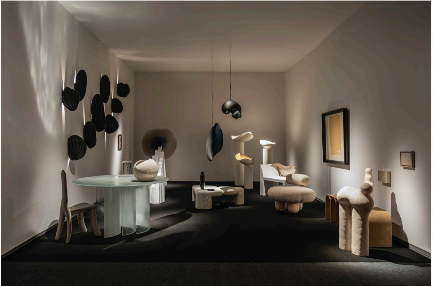
Galerie Philia's 'Contrasts' show at PAD London 2023

Galerie Philia is another enormously impressive gallery that spans continents while successfully maintaining a highly focused aesthetic. With a presence in New York, Mexico City, Geneva and Singapore, Galerie Philia represents a diverse collection of artists, emerging and established, and can seriously lay claim to fostering a global creative community.