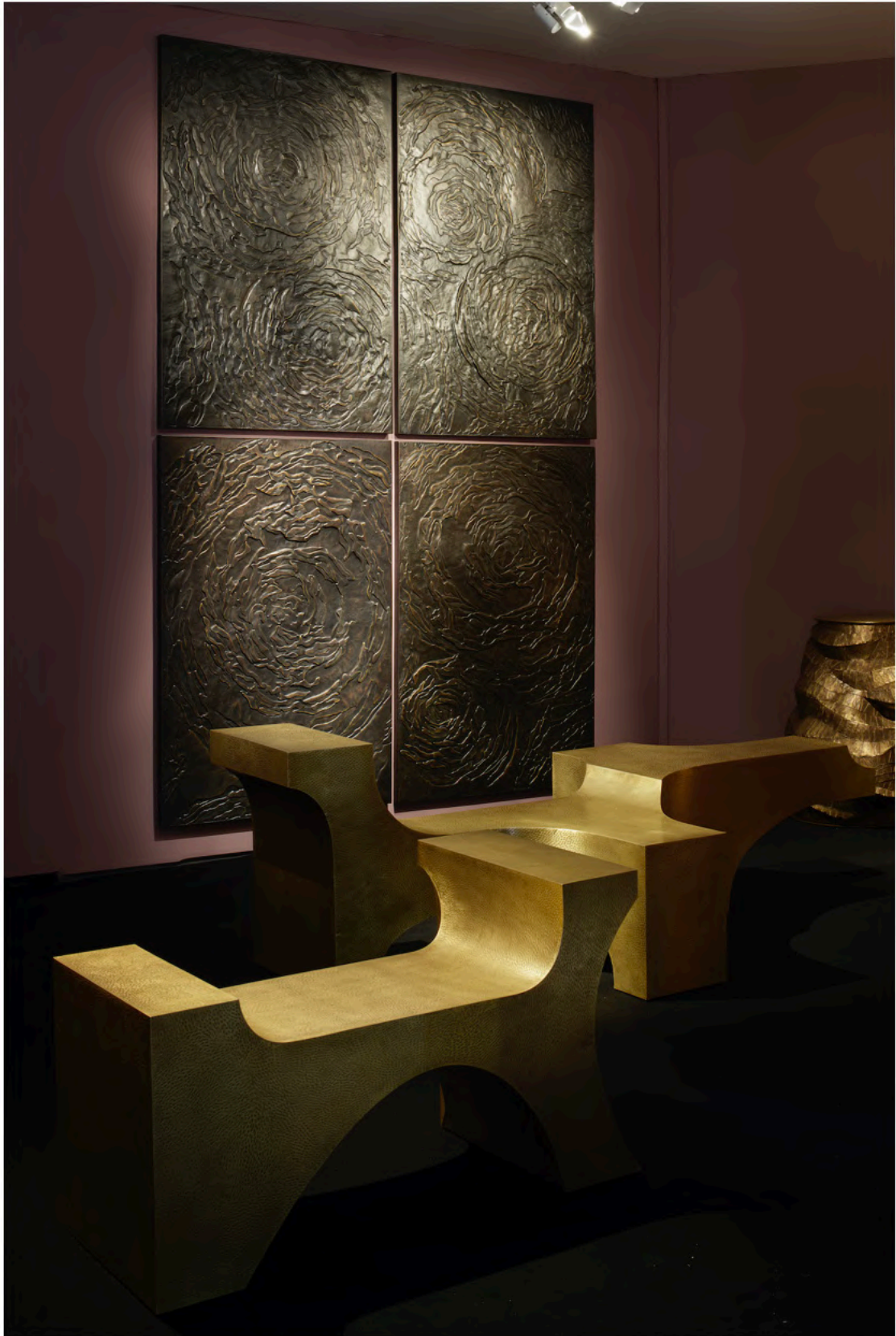
Brass chair, bench and metal wall panels by Vikram Goyal at PAD London 2023