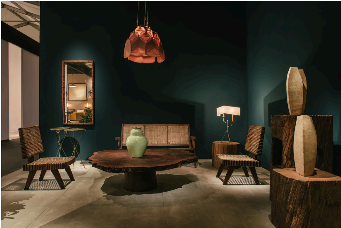
The Rose Uniacke booth at PAD London 2023 includes a rare Chandigarh settee and teak and cane chairs by Pierre Jeanneret with vintage Japanese pendant lights by Ingo Maurer