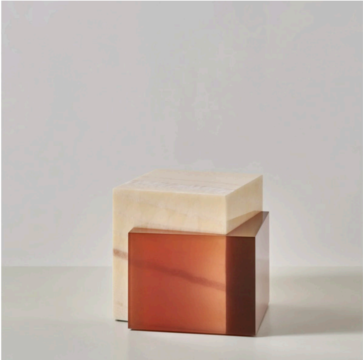
Side table from the new Stacked collection by Sabine Marcelis. Courtesy of SIDE Gallery

Barcelona's SIDE Gallery returns to the fair this year after making its debut in 2019. This year, the gallery will present the new resin furniture collection called Stacked by Sabine Marcelis .