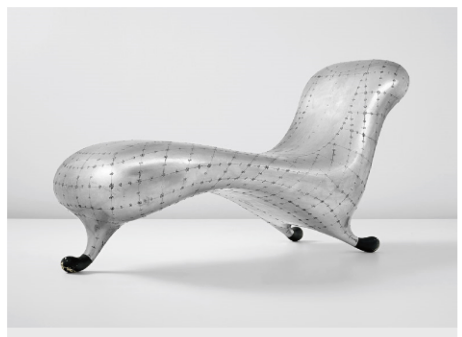
Last year, Marc Newson's Lockheed Lounge became the world's most expensive design object

The London auction house also broke the world auction record for a piece of Nordic design last month, when a dining table by the late Peder Moos sold for over £600,000.