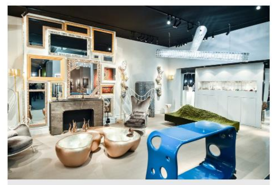
David Gill Gallery's stand at PAD London.

Lombrail spoke to Dezeen at the opening on PAD London, a design fair that runs alongside the Frieze Art Fair this week.