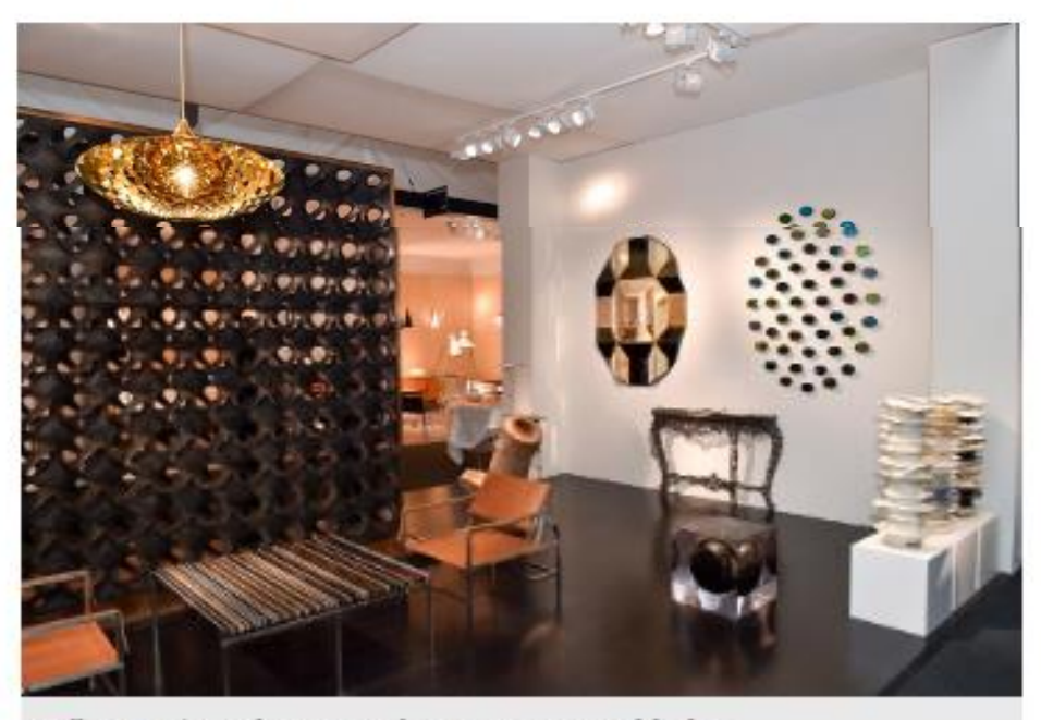
Gallery Fumi's stand at PAD London.

"London is at the moment the most vibrant marketplace in the world, and the most serious one," she added. "This is why we are here every year. We have one leg in design and one leg in art. So this is the key week for us."