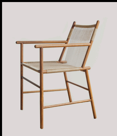
GALERIE MANIERA Bijoy Jain