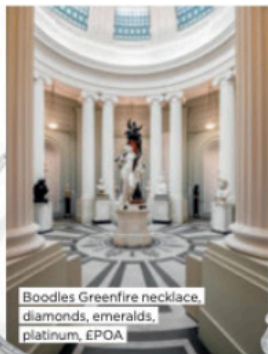
Boodles Greenfire necklace, diamonds, emeralds, platinum, EPOA