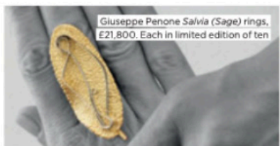
Giuseppe Penone Salvia (Sage) rings, £21,800. Each in limited edition of ten