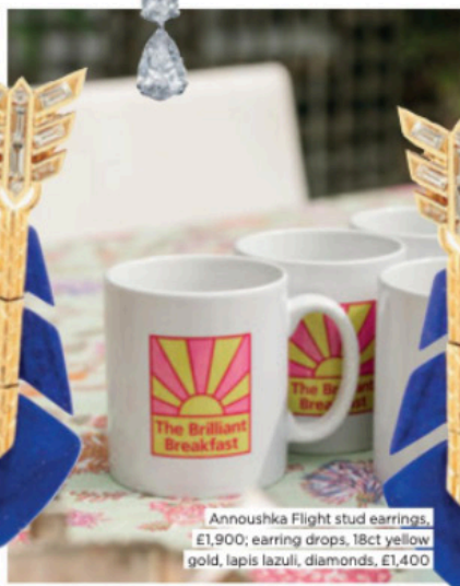
Annoushka Flight stud earrings, £1,900; earring drops, 18ct yellow gold, lapis lazuli, diamonds, £1,400