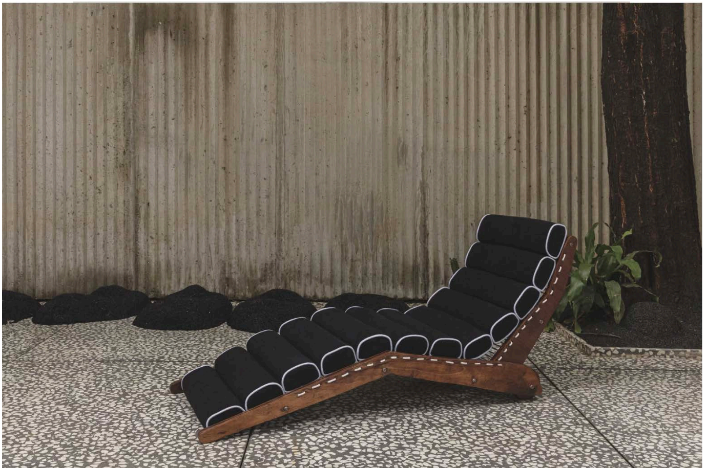
Chaise Longue by Jose Zanine Caldas. Courtesy of JCRD Design.

Ultimately, PAD is designed to inspire collectors, art consultants, museum experts and interior designers – but if you don't fall into any of these categories, it's also just a lovely place to browse.