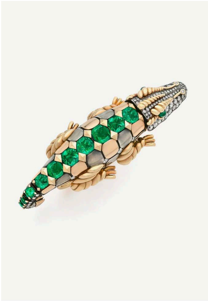
Emerald Bouclier Ring by Elie Top.