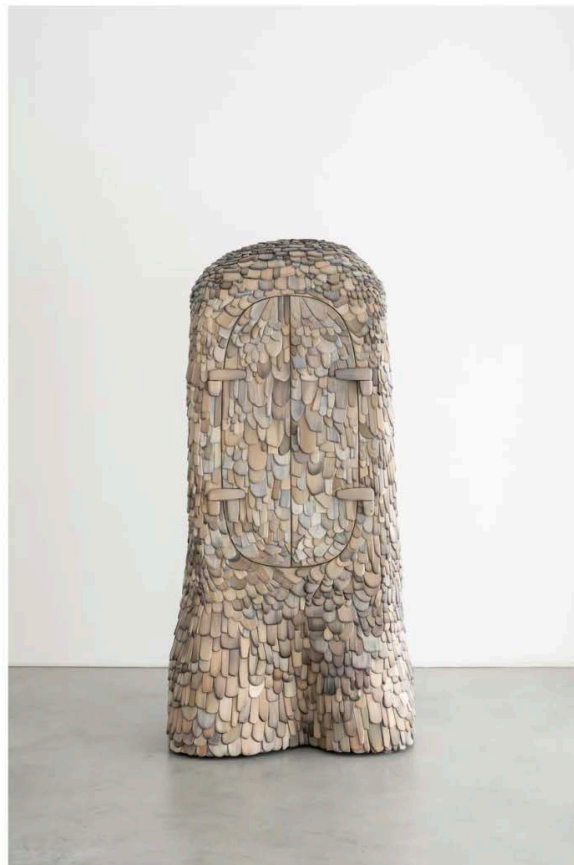
Armadillo cabinet by Lukas Wegwerth (2023). Courtesy Gallery FUMI