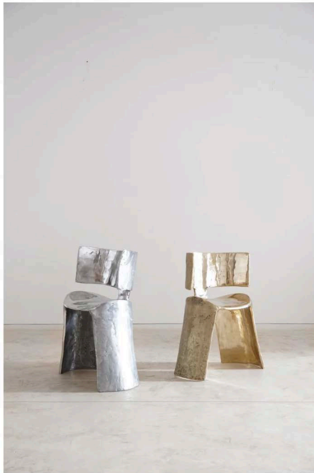
Tavit Chair in Alu+Bronze by Florence Louisy.