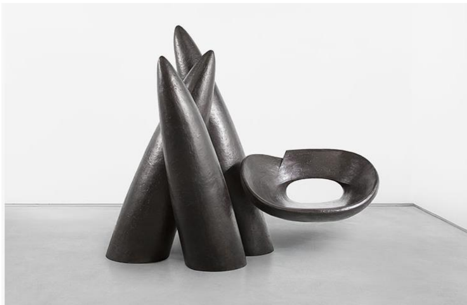
Wendell Castle, Veiled in a Dream , 2014. Bronze. 178 × 205.7 × 122 cm. Limited edition of 8 + 4 APs. Courtesy Carpenters Workshop Gallery . PAD London 2015