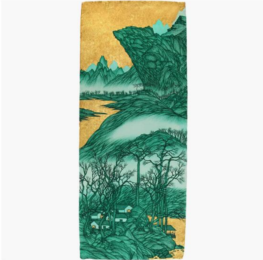
Yao Jui-chung, Good Times: Internet Seclusion , 2015. Ink and gold leaf on paper. 78 3/4 x 31 1/2 in., 200 x 80 cm. PAD London 2015

Michael Goedhuis opened his first gallery in London in 1989, and has since expanded internationally, presenting Chinese art from the Neolithic period to present day.