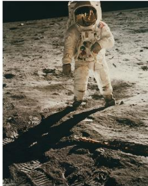
NASA Apollo II Neil Armstrong, Buzz Aldrin , 1969. Pearl glossy paper c-print. 25,5 x 20,5 cm

Daniel Blau opened his first gallery in 1990 in Munich, attracting the art world’s attention with groundbreaking exhibitions by contemporary masters — including the first German gallery exhibition of works by Lucian Freud.