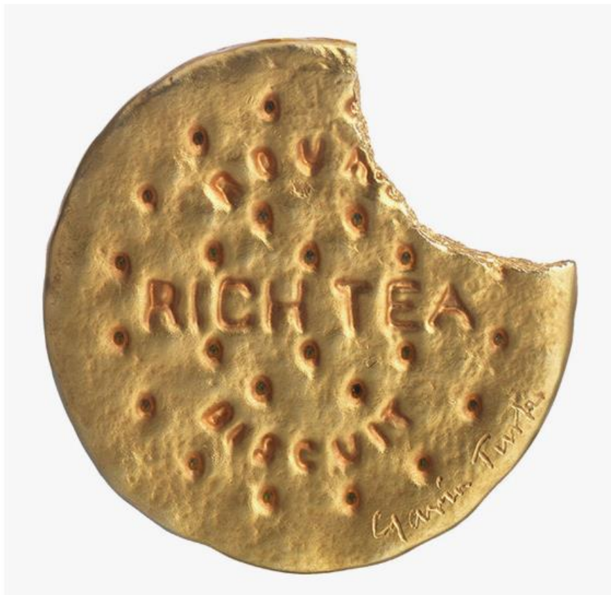
Gavin Turk, Ceremonial Biscuit, Large , 2014. 18k gold. 6.5 cm x 0.5 cm. PAD London 2015

Opened in 2003, Louisa Guinness' eponymous London gallery fast became known as the capital's leading exhibitor of artist's jewellery, with works by 20th century masters — including Picasso, Calder, and Man Ray — presented alongside pieces by contemporary artists including Anish Kapoor, Antony Gormley and Sam Taylor-Wood.