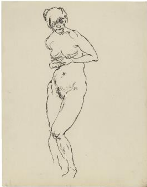
George Grosz (1893-1956), Stehender weiblicher Akt, Hände vor der Brust gefaltet, 1913/14. Ink on paper. 28.4 x 22.7 cm, PAD London 2015