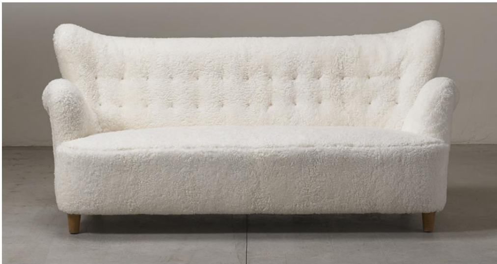
Gustav Axel Berg sofa, 1943, offered by Nilufar Gallery