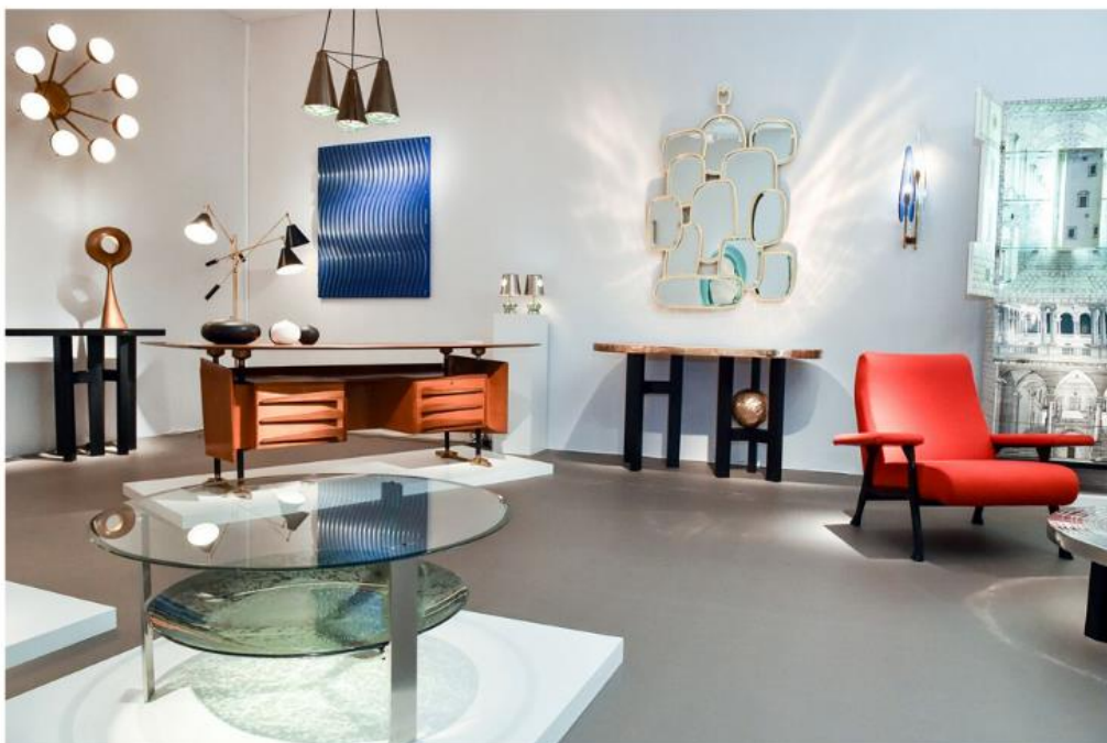
The booth of 88 Gallery , which is based on London’s Pimlico Road, showcases 20th-century decorative arts from Italy, France, Belgium and the United States.