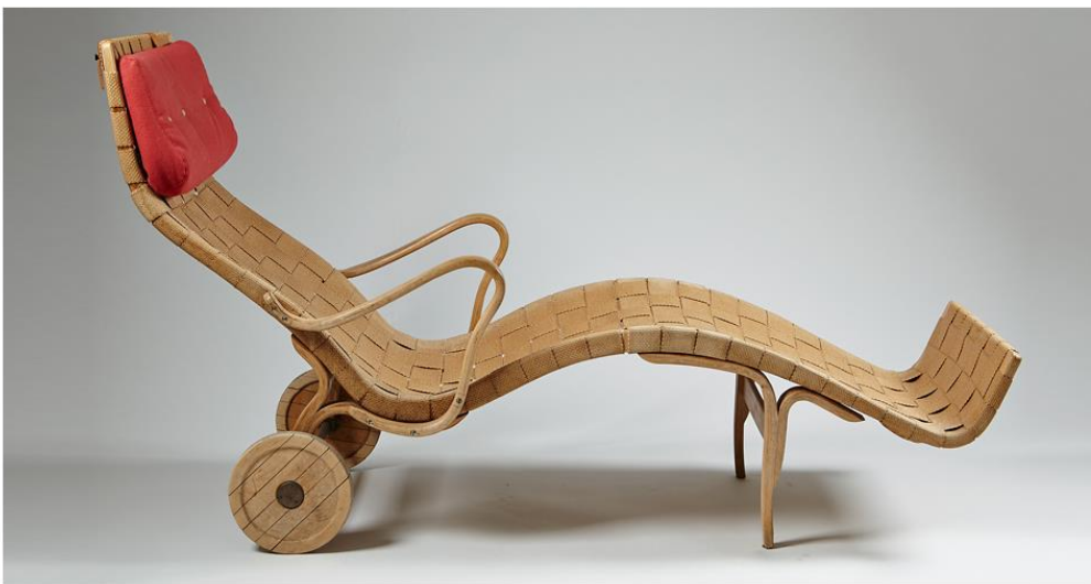
Bruno Mathsson for Karl Mathsson's bent-birch and brass chaise longue, 1942, offered by Modernity.