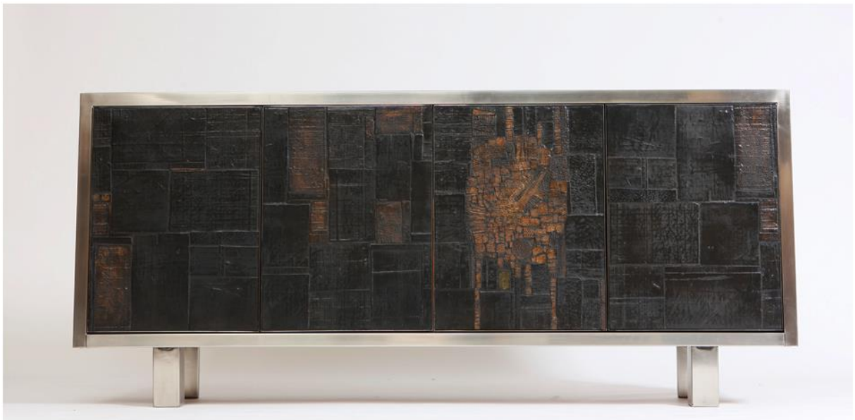
Pia Manu Ceramic four-panel sideboard, ca. 1970, offered by Magen H Gallery

To provide a sense of the vitality of the mix on offer at PAD London, we present here some of the best offerings from participating Istdibs dealers.