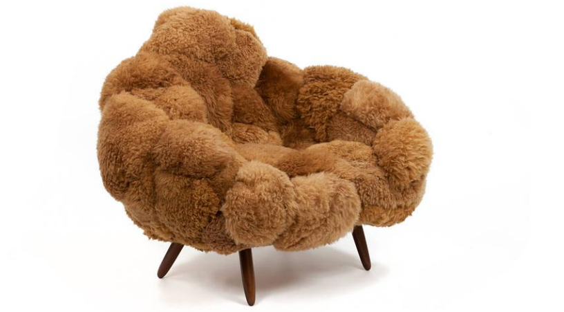
Fernando and Humberto Campana Bolotas armchair, offered by Friedman Benda